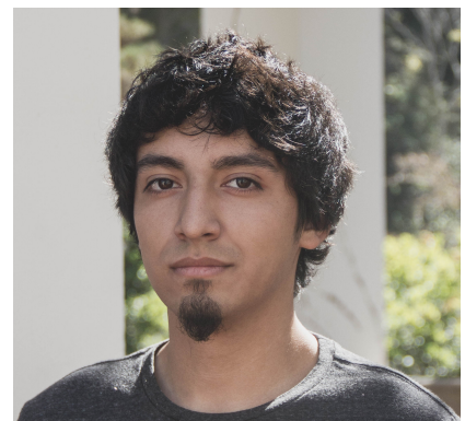
Stephen, Overseer First martyr of Christianity