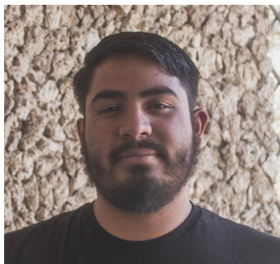
Barnabas, Christian Later partners with Paul