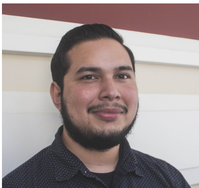
Peter, Apostle Spokesperson of early church