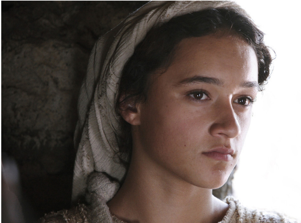
Mary in the Nativity Story (2006).