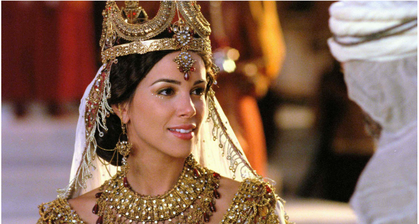
Queen Esther in One Night with the King (2006).