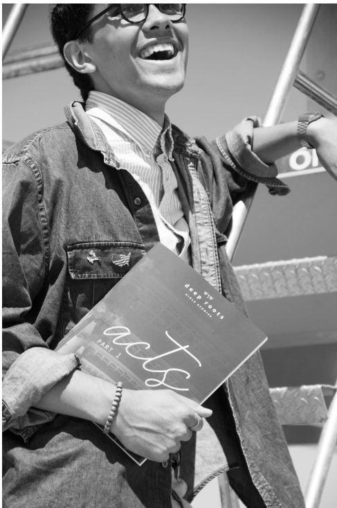
Deep Roots Bible studies are perfect for college students

Deep Roots is "here to give you structure for your devotional time, and provide historical and cultural context for each passage." Each study is designed to last about 15 minutes, so even the busiest people (like us college students!) will have time for them.