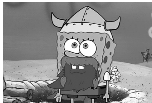
Spongebob remembers Leif Erikson. Do you?

For more information about Indigenous Peoples' Day, visit http://www.latimes.com/local/lanow/la-me-ln-indigenous-peoples-day-20170829-story.html .