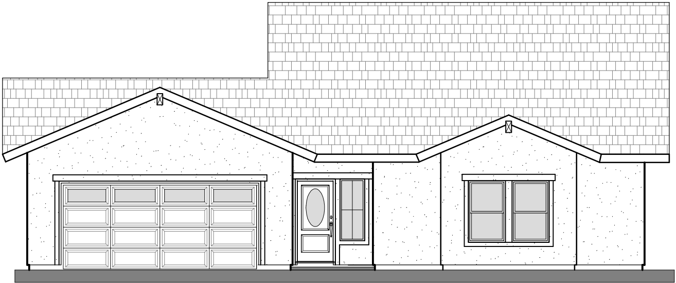
(elevation 'B' w/ stucco)