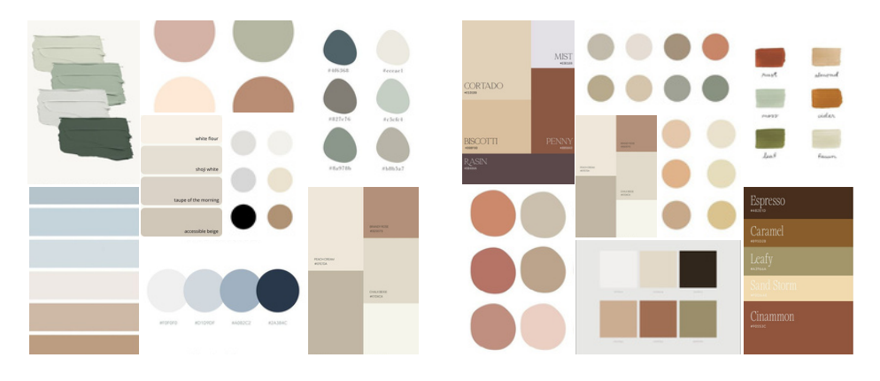
neutral - timeless - soft

When choosing your wardrobe, consider the location, time of year, and overall mood you want! Typically aim to omit strong patterns and focus on textured fabrics instead so that the emphasis remains on you!