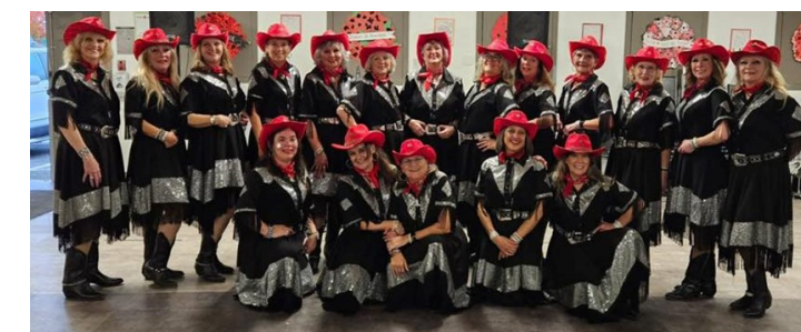
DIAMOND COUNTRY DANCERS Wednesday | June 25 | 2 pm | MPR