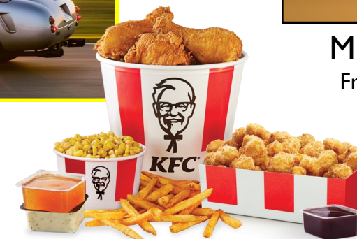
KFC LUNCHES Thursday | June 19 | 12 pm Rose and Willow Thursday | June 26 | 12 pm Magnolia and Camelia