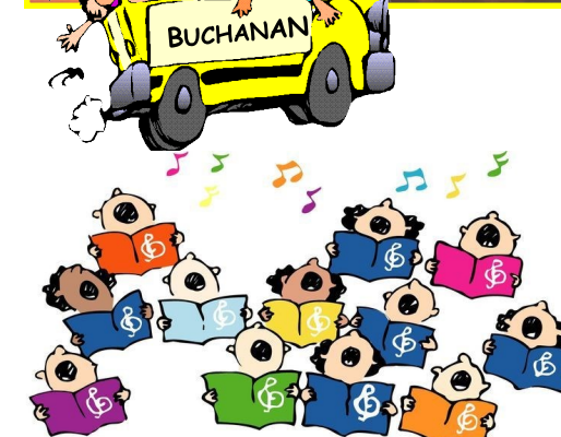
ANDANTE CHOIR Thursday | June 5 | 1 pm | MPR