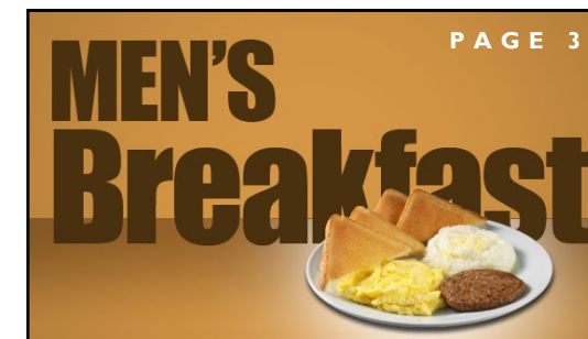
MEN'S BREAKFAST Friday | June 6 | 8 am | MPR