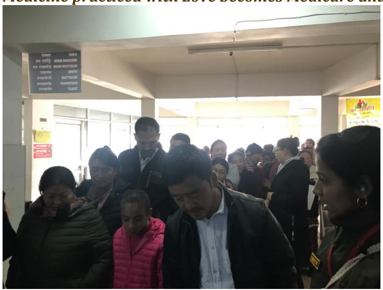
Our gratitude to all the people of this heavenly district for giving us this opportunity

This time around 540 patients had been treated with the most Loving Medicare and over 36,000 Patients have been treated all over India by Team Sai Aashraya. Sai Aashraya has adopted 6 villages and all of them continue to show tremendous progress. Our Gratitude to all the local volunteers who selflessly serve the people around them on a day to day basis. Sai Aashraya will be adopting more villages in the future with the same model of Loving and Holistic Care being implemented. As the day drew to a close, our hearts welled up in Gratitude to all the people of this heavenly district for giving us an opportunity to serve them. As night set in, the last batch of patients were treated and were leaving for their homes. We started packing up with hearts filled with the Love that the people had showered upon us. "We will wait till we see You in May" said many of our patients and it indeed will be a long wait till May Comes Calling. This time's Seva was the most challenging one so far. Yes there were those tough moments where we could have done better. But we stuck together as an unit and did the best we could. It's said, "Some goals are so worthy, it is Glorious even to fail". We will be better prepared the next time and do better.