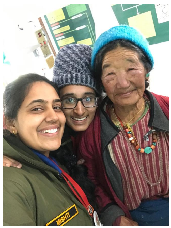
The Granny's Smile says it all!