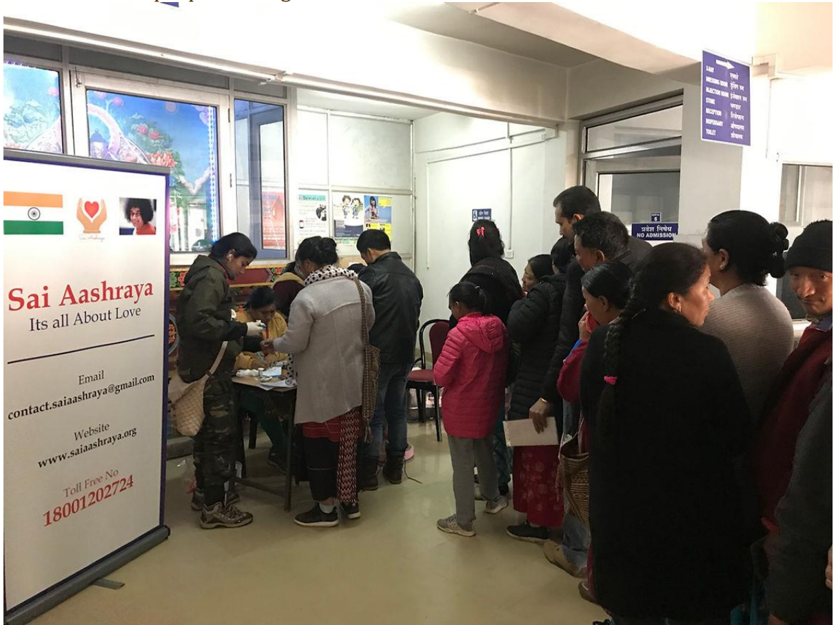
Patients at Sai Aashraya's registration counter in the District Hospital

"Medicine when practiced with Love becomes Medicare" says Our Master. All our old patients showed remarkable improvement. It clearly was not the medicines doing the magic. It is Love that heals in a way no other medicine can. In Sai Aashraya we are witness to this magic that Love creates every day. Even as the day progressed we saw more and more people coming in.