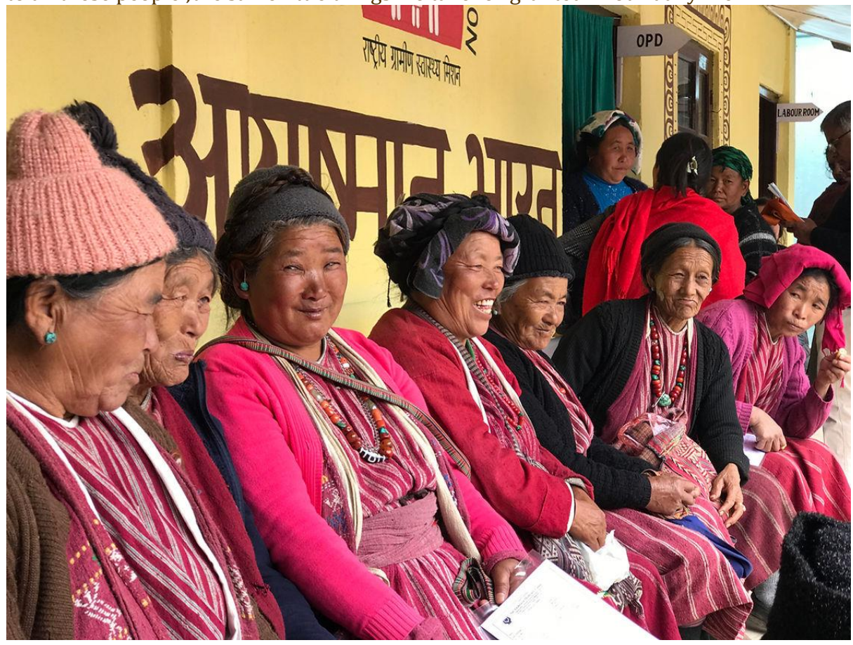
Our Grannies waiting to meet the Doctors

The patient here was referring to how cold it would normally be while cardiac examination was being done and how cold he would feel. He said "I used to feel very cold before. But now I just love sitting inside (The mobile hospital). It feels like home inside!" It is such a special feeling to see how the little things make such a big difference to all these people; the same little things we take for granted in our daily life!