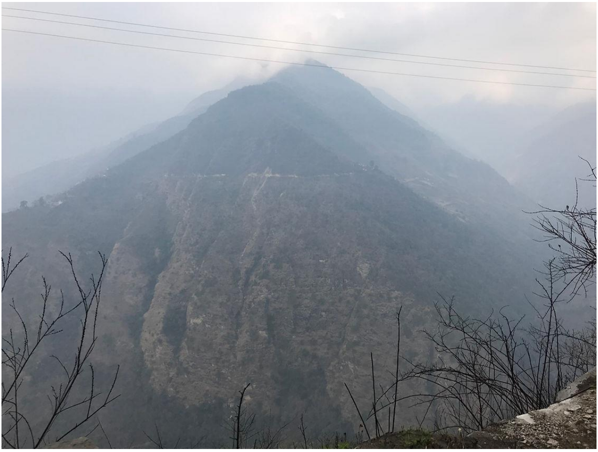
Amidst the mighty mountains on the way to our villages

The sun came out gradually and we were driving through tough terrain. But the roads were actually better than before. The Border Roads Organisation works tirelessly to make travel better all the time. We salute all those women and men who make this happen. It was the visibility that was slowing us down. The views during the drive is something all of us look forward to and Mother Nature didn't disappoint us. It was a Blissful feeling all the way through the 4\frac{1}{2} hours journey to our destination. Even as we were reaching our venue people living in and around the area recognised our mobile hospital and gave us a hearty welcome! Once we reached, the people around came rushing and helped us get ready for the Seva. Jawans from a nearby unit were also there waiting for us. It was an honor to meet them and also get an opportunity to treat some of them on this special day.