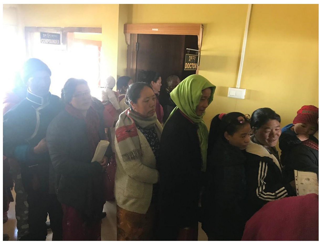
Patients waiting for their consultation