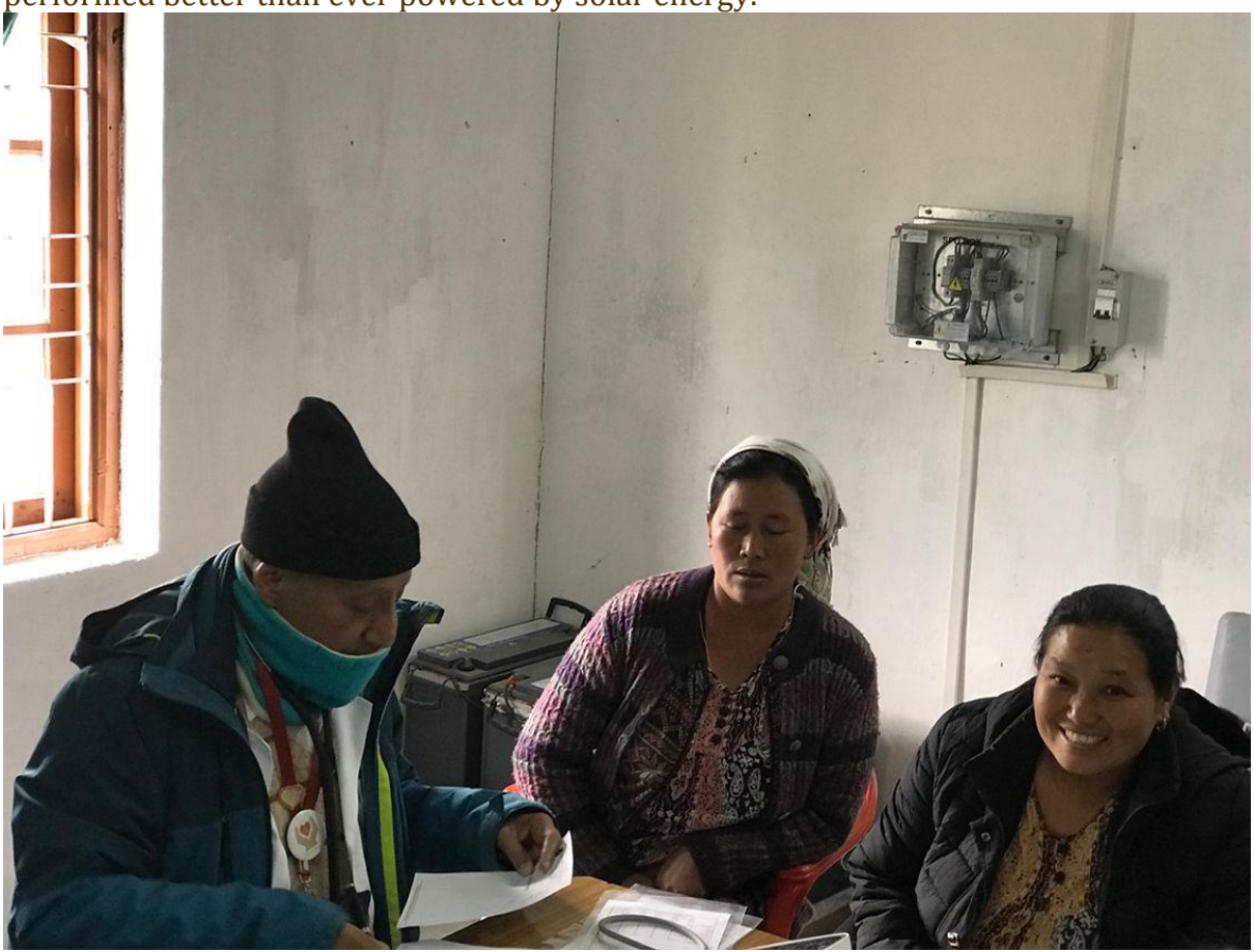
When the treatment comes from a heart made of gold, a golden radiant smile is the result!

performed better than ever powered by solar energy.