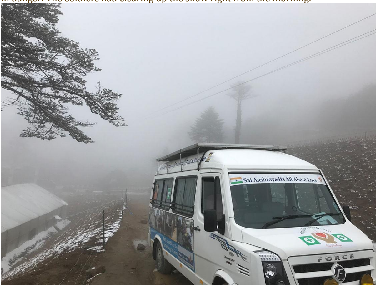
@ 10,000 Feet before entering tougher terrain!

At 6:30am the next morning, our journey began to Tawang District. We got our big fuel cans filled up for rest of the Seva as fuel can be a real problem if we are not prepared. In an hour's time we began the climb. The drive was getting harder than ever and it was too cold even before we reached 10,000 feet to the Baisakhi Garrison where we generally stop for breakfast. Once we reached the Baisakhi Garrison we headed to the Madras Café where we were welcomed by our Jawans whom we were meeting regularly and one of them enquired about a team member of ours who couldn't come for this time's Seva. By this time it was snowing heavily outside. Very soon we received information about the Indian Army taking safety measures to make sure that no one is in danger. The Soldiers had clearing up the snow right from the morning.