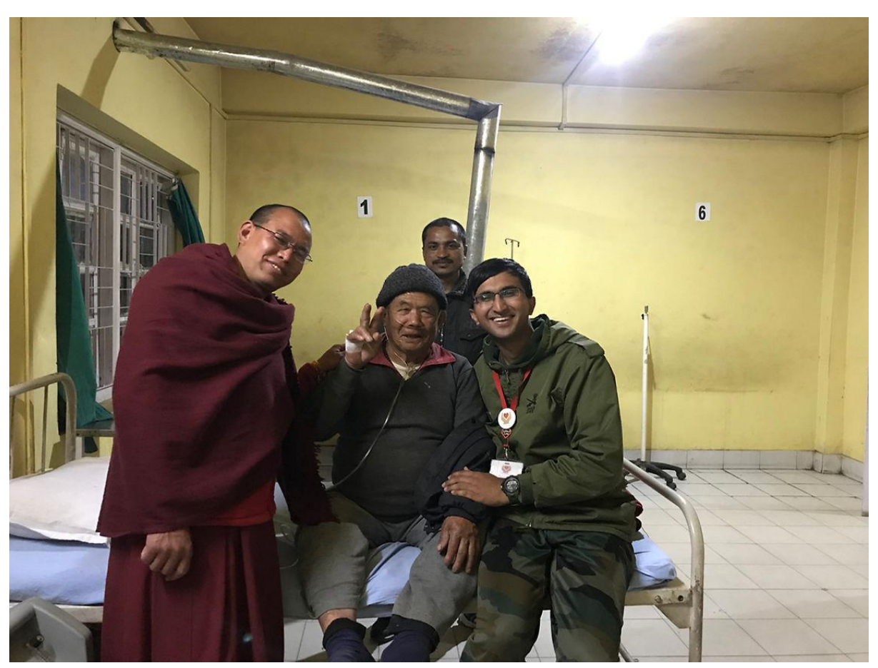
The most Loving Smile! The Complete Smile!

Even as the last patient was treated with the same Loving care, we could feel the impact Love & Selfless Service was having on us. It is an opportunity that all our people are giving us to do what we do today. The Lamas waited till the end and helped us load everything into our vehicles. They stood outside in the cold helping us out and only started back after our vehicles moved. We offer our Gratitude to all the Lamas who are verily the embodiments of Love & Peace.