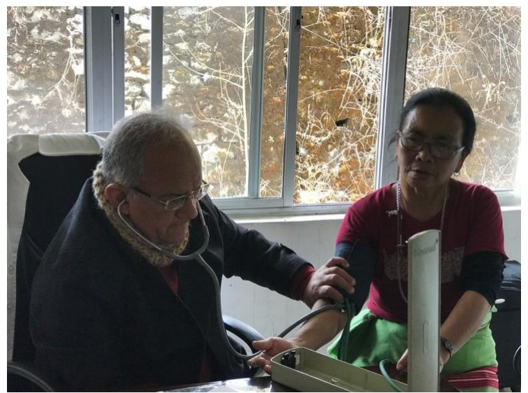
Medicine practiced with Love becomes Medicare and there's the example!