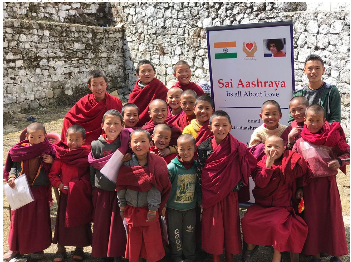
Their smiles are verily like sunshine on a rainy day!

We reached our venue at 9:00am and by 9:30am there was a huge line outside. It was going to be a challenging day ahead for the whole team. The Monks lovingly helped us out and so did the staff of the Monastery. Soon treatment began and the first to be treated were the Lamas ( The Elder Monks). All of their health condition had improved. Blood sugars were normal, Blood pressure readings stable, cardiac status had improved, and skin ailments were getting cured . It was a wonderful feeling. All of them are a treasure of eternal ancient wisdom which they impart to the Young Monks. The Young Monks had come from their school and it was as usual the most vibrant atmosphere when they came in. It was a relief to see them relieved of skin ailments.