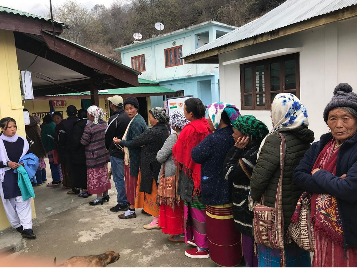
Patients waiting for registration in Kitpi....The weather began to clear up as they arrived!

Shortly after, the Medicare camp began and there was a long queue. The weather kept getting better and as the sun came out, the people around attributed it to our coming there. "Aapke aane se mausam hi badal gayaa" said one of them as everyone echoed the same. The Doctors were very busy on this day as some of the new patients needed special care. Most of our old patients came and our volunteers in the village had made sure that they were regularly taking their medicines and had also brought many of them in different vehicles to avoid them walking from all the way uphill/downhill and then going back. Yet there were so many who had come walking with their children tied to their backs and in some cases the children with those tiny little fete had also come walking.