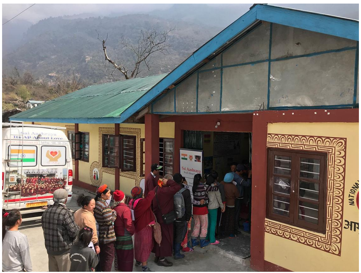
Patients wait at our venue in Zemithang....

All our old patients had improved and it was absolutely miraculous improvement in some cases. Our mobile hospital was being used for cardiac examination. It was also a source of comfort for parents with infants. They were seated inside while waiting for their turn to get treated. It was turning out to be a busy day but things got tougher when some new patients came in with serious problems. Our Doctors were working tirelessly to ensure timely treatment and the rest of the team was making sure that the patients were always in a positive frame of mind. Many of them had not even consulted a Doctor ever before! They had all come by word of mouth!