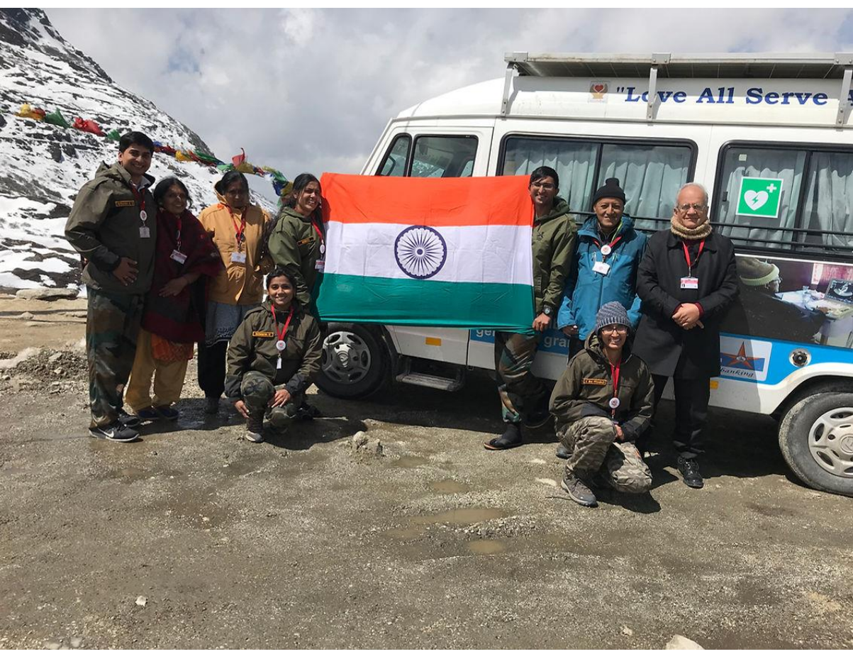
With Abundant Love, Team Sai Aashraya

It's going to be two days of travel back to Assam in extreme weather. Our Mobile Hospital will be travelling by road for 3 ½ days spreading more Love all around. Yet another edition Blissful Time Of Love & Service in Arunachal draws to a close and so does this blog. We'll keep you all posted. Till then take care. Tagra Raho! Jai Hind!