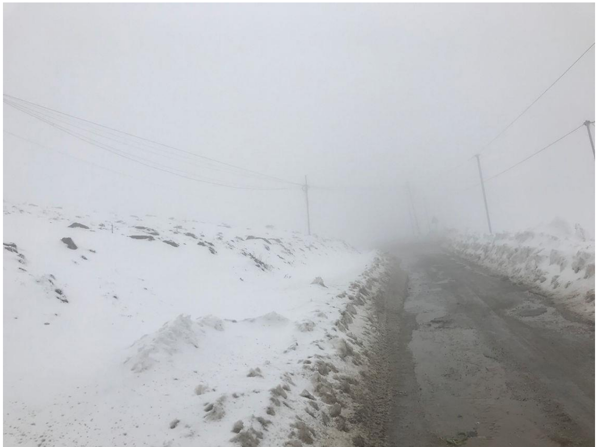
The road to Heaven! @ 14,000 Feet

We slowly got moving and with near zero visibility there were a few nerves all around. We were moving literally at snail's pace. As we neared an altitude of 14,000 feet we could barely see anything. The mobile hospital and the SUV become aeroplanes moving through the clouds and heavy snowfall. The windspeed was also high. The Indian Army and the Border Roads Organisation were working tirelessly to ensure everyone's safety while shivering in the cold themselves. We Salute All Our Forces for all that they do for us, sacrificing their today for our tomorrow. It was 2 \frac{1}{2} hours of driving in the most extreme weather. The oxygen levels at such an altitude is always on the lower side and more so when the weather turns down south.