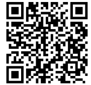
Read Aloud Video

Here is a little background information about our First Chapter Friday title and its creator. Feel free to add your own notes and thoughts in the bottom box.