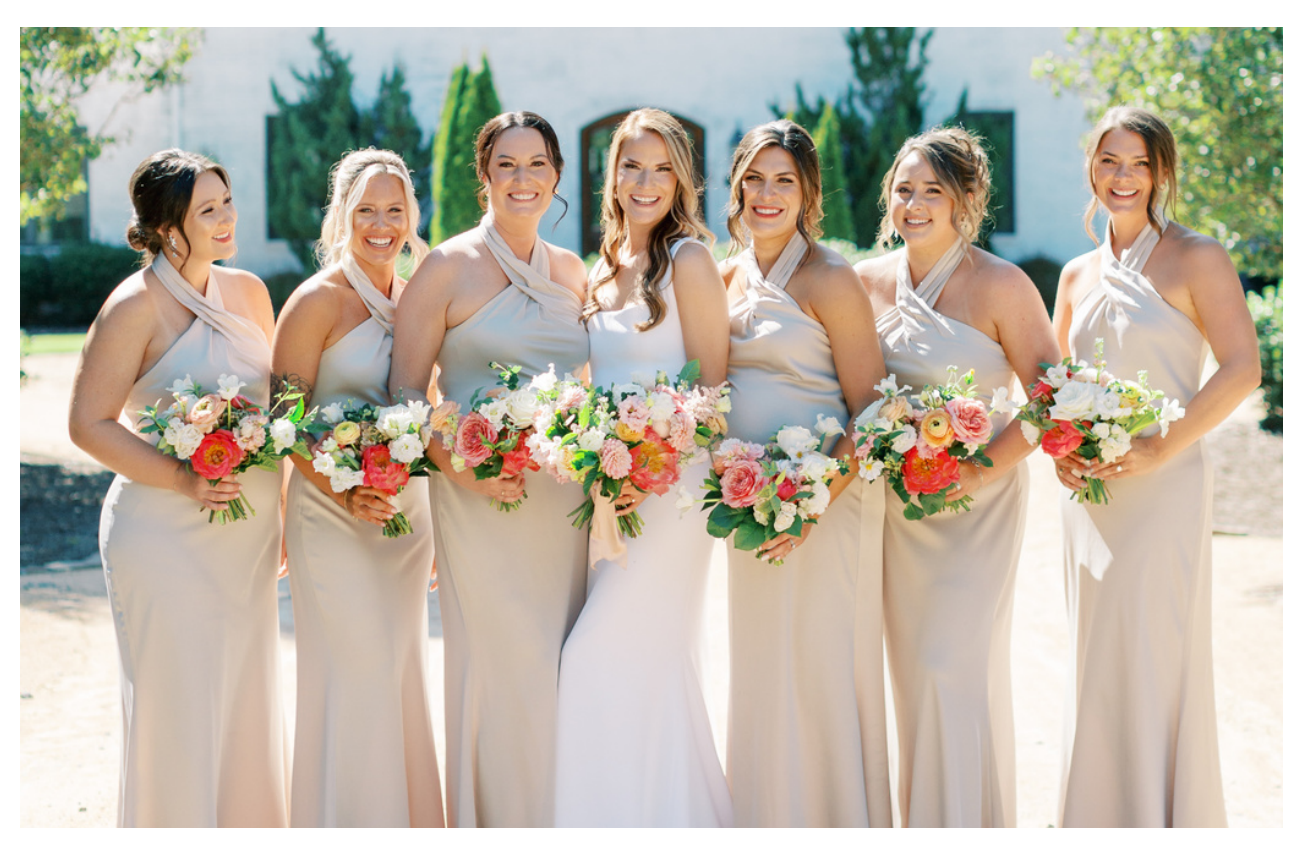
BRIDAL PRICING GUIDE