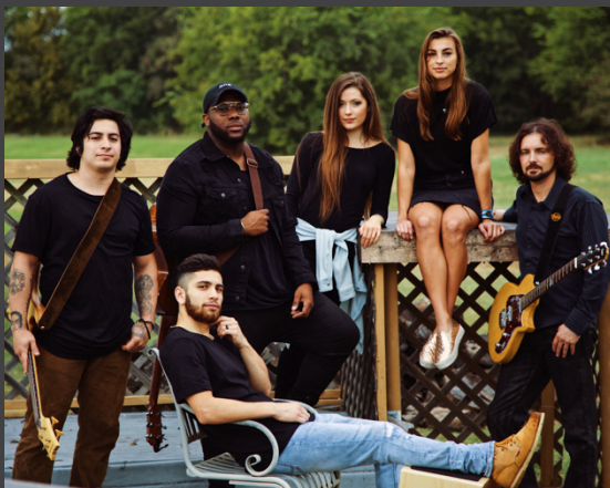
INTV – Dallas, Texas