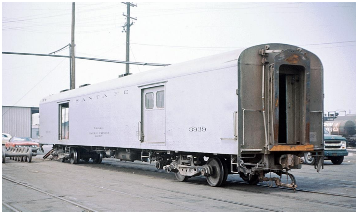
Photo of #3939 in Los Angeles on June 29 th, 1973