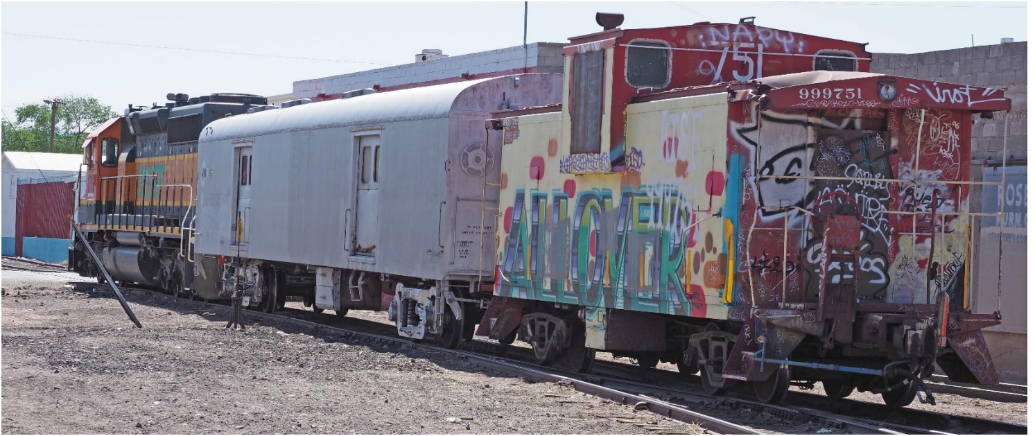
A little after 10 AM SD40-2 #1712 arrived pushing a decorated caboose and NMSX #3939. These were parked west across 8 th Street so the BNSF could do the tool car waltz with the 2926.