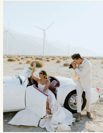
Elopement | Palm Springs, CA