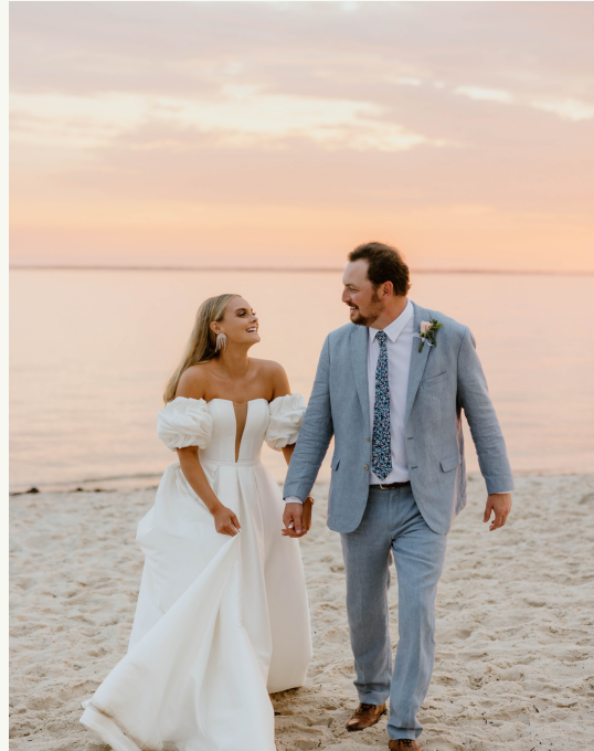
Wedding Photography & Videography | Port St. Joe, FL