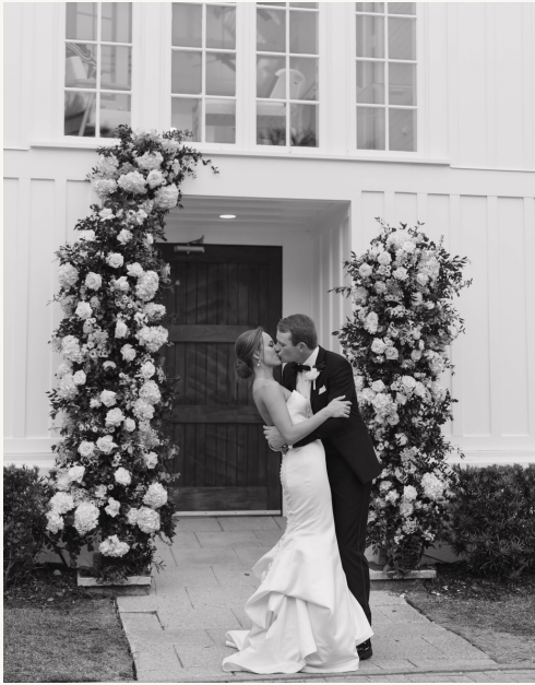
Wedding Photography | Seaside, FL