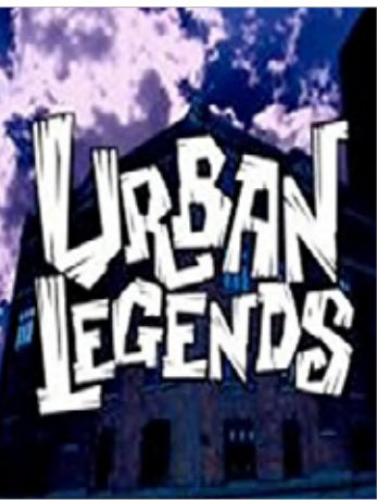
URBAN LEGENDS (2007)