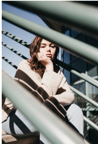
urban / downtown