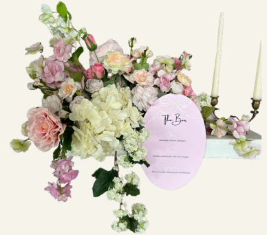
TABLE NUMBERS UP TO 14

LITTLE MOMENTS BUNDLE or 2 ACRYLIC SIGNS (UP TO 4 PRINTED AND FRAMED SIGNS)