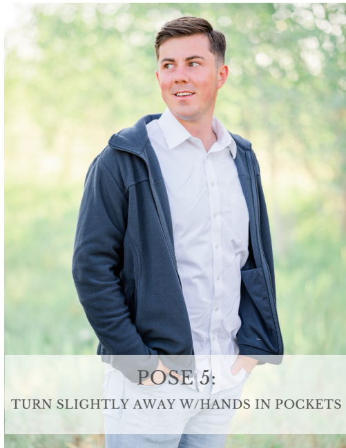
POSE 5: TURN SLIGHTLY AWAY W/HANDS IN POCKETS