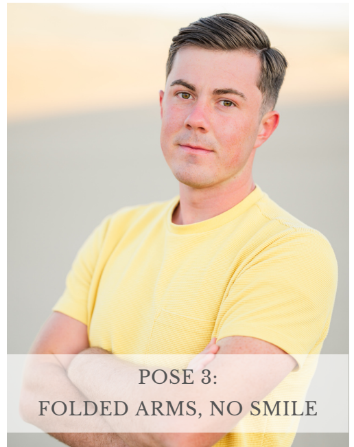
POSE 3: FOLDED ARMS, NO SMILE