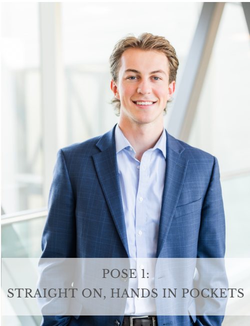
POSE 1: STRAIGHT ON, HANDS IN POCKETS