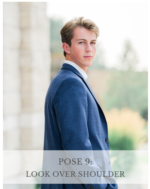
POSE 9: LOOK OVER SHOULDER