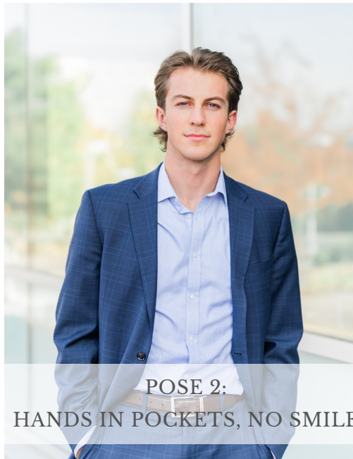
POSE 2: HANDS IN POCKETS, NO SMILE