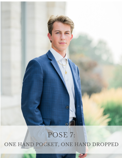
POSE 7: ONE HAND POCKET, ONE HAND DROPPED