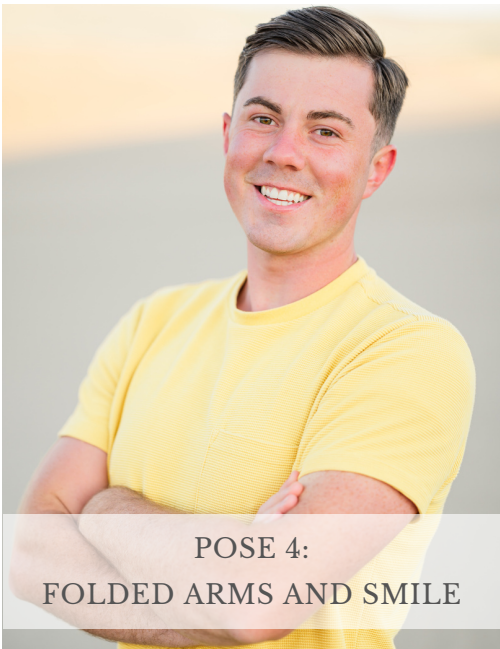
POSE 4: FOLDED ARMS AND SMILE