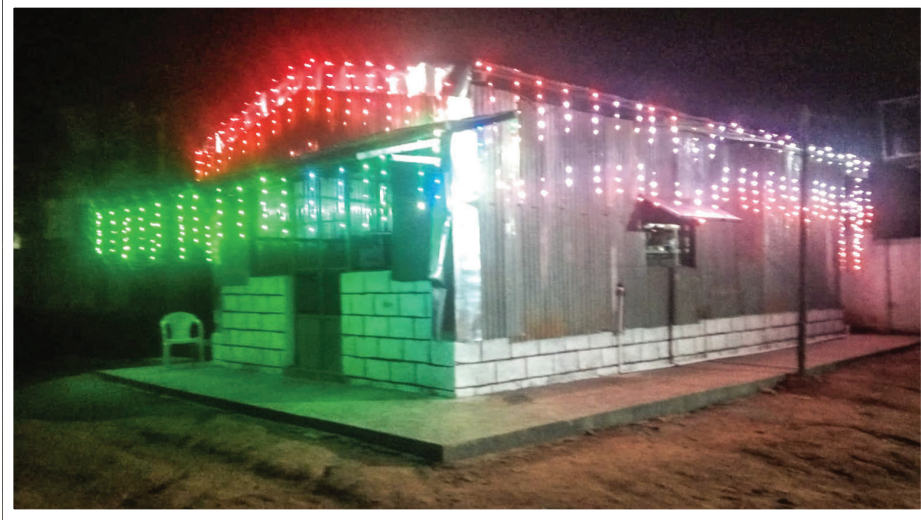
The Makeshift Kitchen building

The Deepavali festivities were simply amazing at the construction site. They had decked up the Kitchen and the Neem tree with scintillating lighting. Sweets and New Clothes were distributed to all. They are now an integral part of our family. With the heavy rains in October and the winter slowly beginning to set in, we felt that the staff will also need to be as warm as possible as it gets chilly in the nights in this area. New Sweaters and Blankets were distributed to all of them., Christmas gave us another opportunity to celebrate, and the festivities brought joy all around. With all the important milestones being achieved well in time, Christmas day gave us all an opportunity to reflect upon the work that has been carried out and the road ahead.