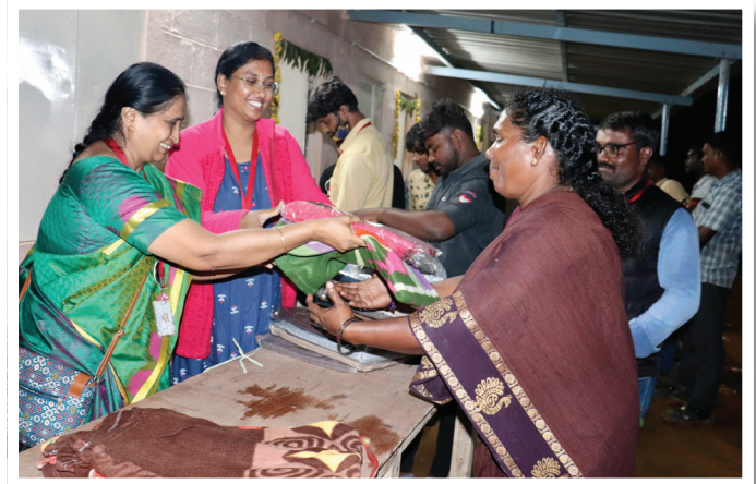
Warm blankets and sweaters distribution