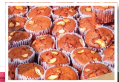
Christmas Plum Cakes & Provisions distribution

Our volunteers spent quality time with the residents of the villages and all the elders shared their powerful thoughts and guided us in making the roadmap for the year ahead. We will surely work towards bringing more Love & Joy to the lives of all these inspiring people. To read more about the story of Sai Aashraya Adarsh Gram, a testimony to the power of pure Love & Sacrifice, please do watch this video on our YouTube channel https://www.youtube.com/watch?v=cUARnT0DI3o