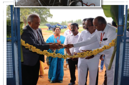
The Makeshift Kitchen