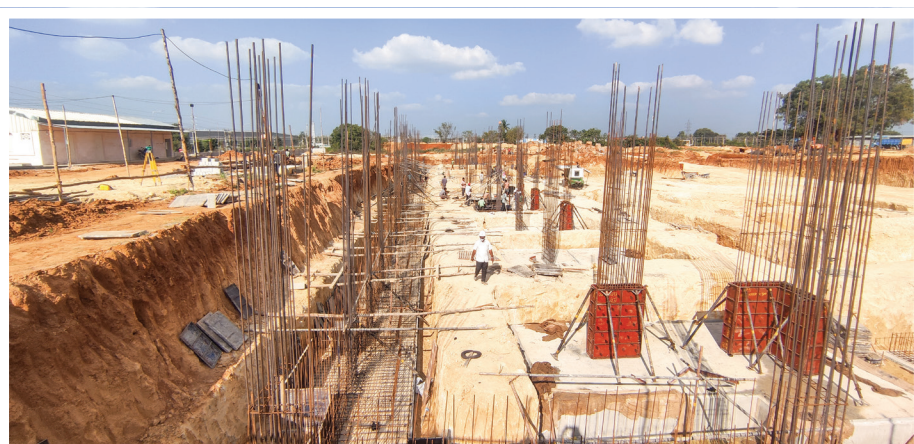
Foundation for the Hospital Block

Other Amenities - Makeshift Kitchen - State-of-the-art Makeshift Kitchen to serve on-site construction staff, fully operational - capable of five servings a day. - Modular Kitchen for fully functional Hospital - Design and BOQ Complete. - Vendor finalised; Design for Modular Kitchen complete (June 2021) - Onboarding of Medical & Non-medical staff