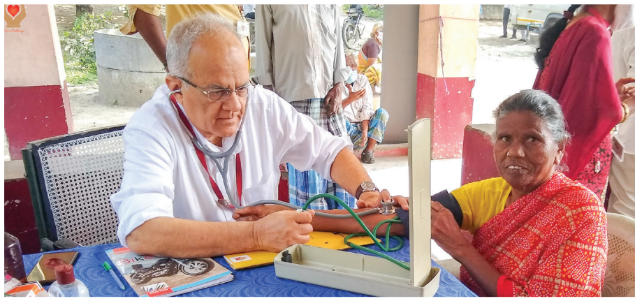
Medicare Camp in Sai Aashraya Adarsh Gram (in Dharmapuri, Tamilnadu)

The Monthly Leprosy care and Super Speciality Medicare Camps in Sai Aashraya Adarsh Gram, the first village adopted by Sai Aashraya (in Dharmapuri, Tamilnadu), were conducted successfully, as always, with great Love and Dedication by our volunteers. In the past three camps held, as always, on the third Sunday of the month (17 th of October, 21 st of November and the 19 th of December), over 350 Patients from this village and neighbouring villages were treated lovingly by our team of Doctors and Volunteers. Provisions for one month was also distributed to all the 70 Families residing in the village as always.