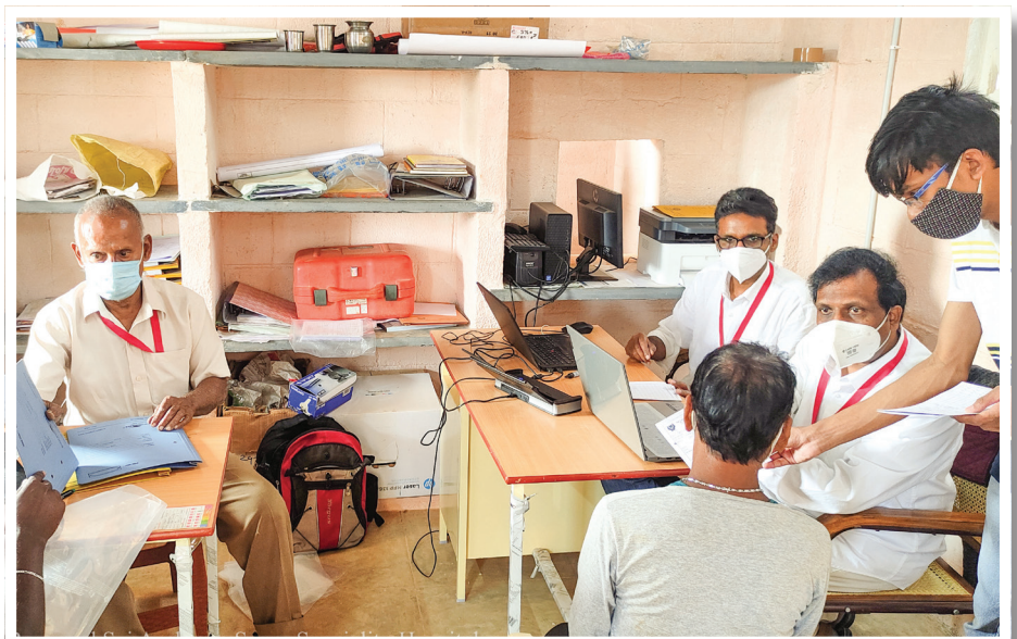
Patient Files and EHR Records Processing at site

people and the strong camaraderie that is there in the team. More than the Hospital itself, this journey filled with such precious life lessons are the most important for all of us in Sai Aashraya. Like it is said in Hindi, सफर खूबसूरत है मंज़िल से भी 'The Journey is more beautiful than the destination.'