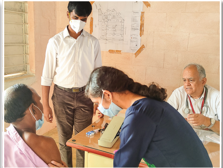
Medicare Camp for construction staff

scaled up to 70. By the second week of December, the number of staff was 130. It is a joy to see all of them work together as one team to make this dream come true.