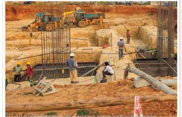
The construction site - Sai Aashraya's Super Speciality Hospital