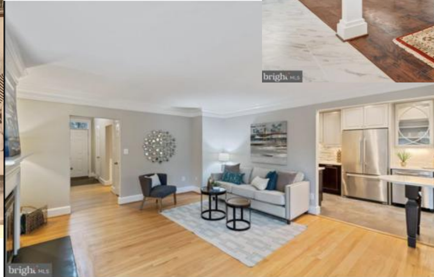
Client Inspiration pics