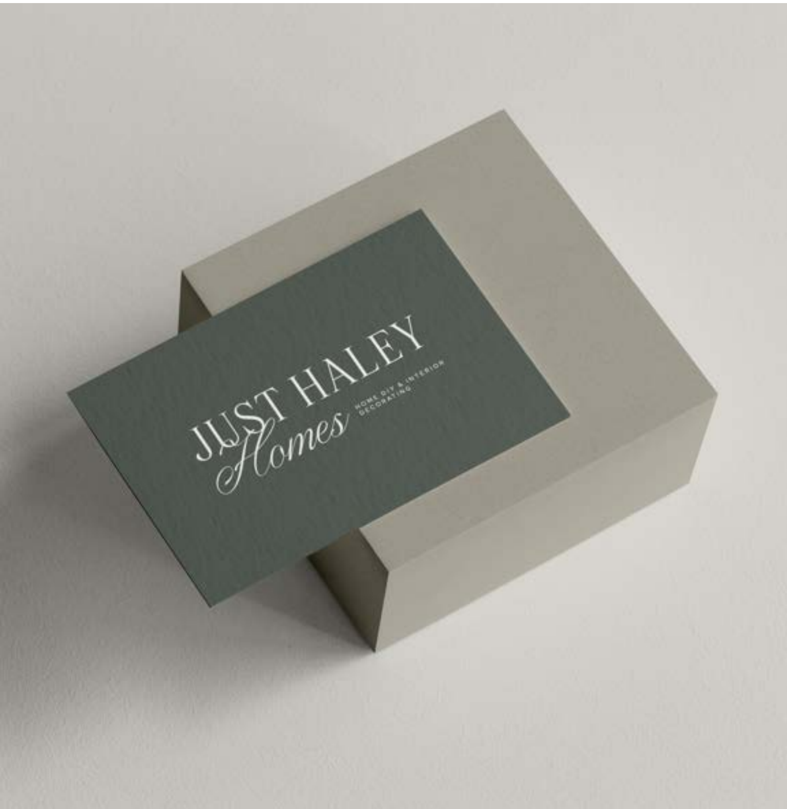
CUSTOM BRAND DESIGN