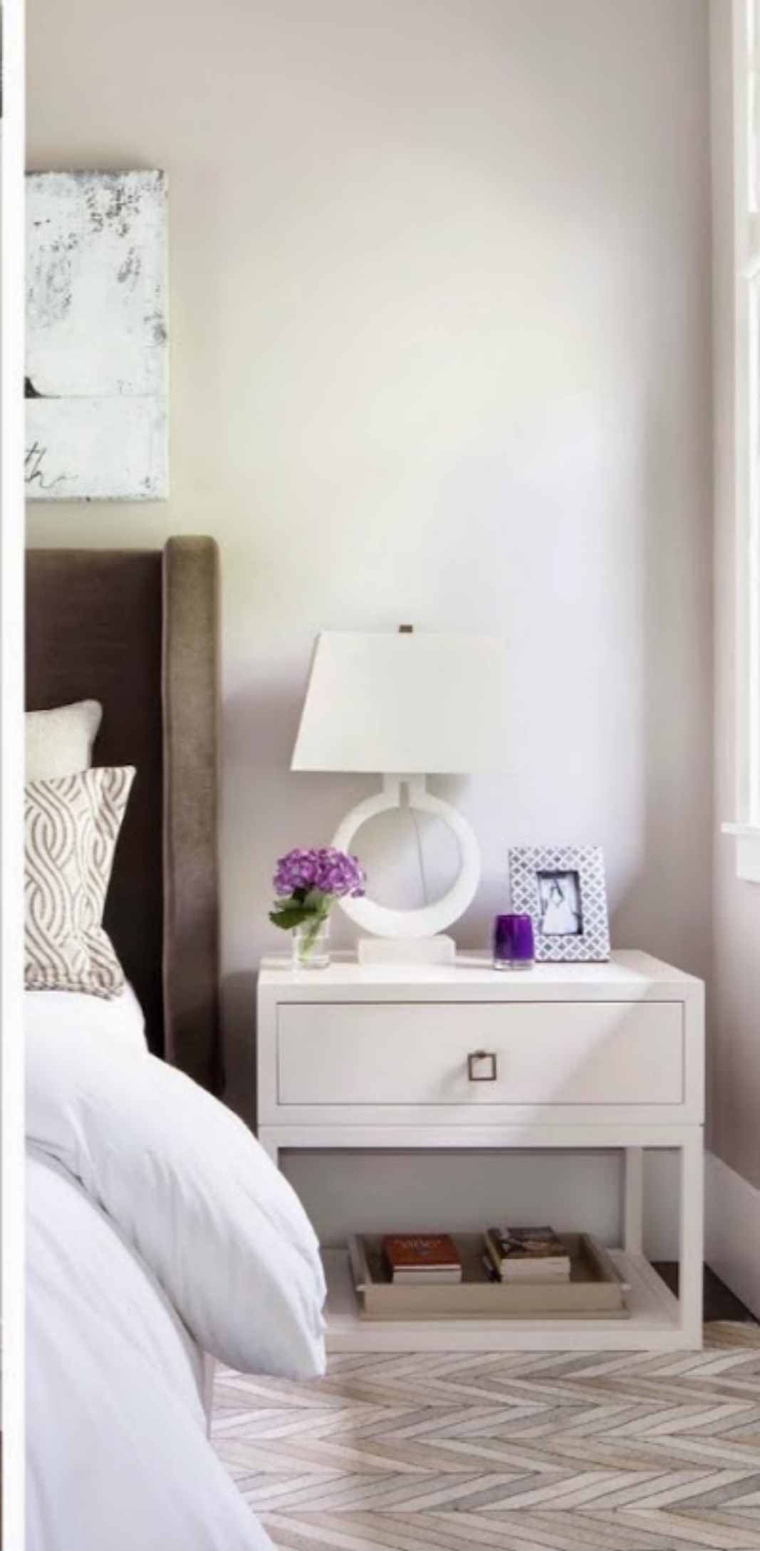
Master bedroom An upholstered bed from the Maggie Cruz Home Collection lends softness to the space and joins an Urban Loft rug, a vintage Louis Vuitton trunk, and pale walls painted Benjamin Moore's "Calm" in creating a romantic retreat for the homeowners.