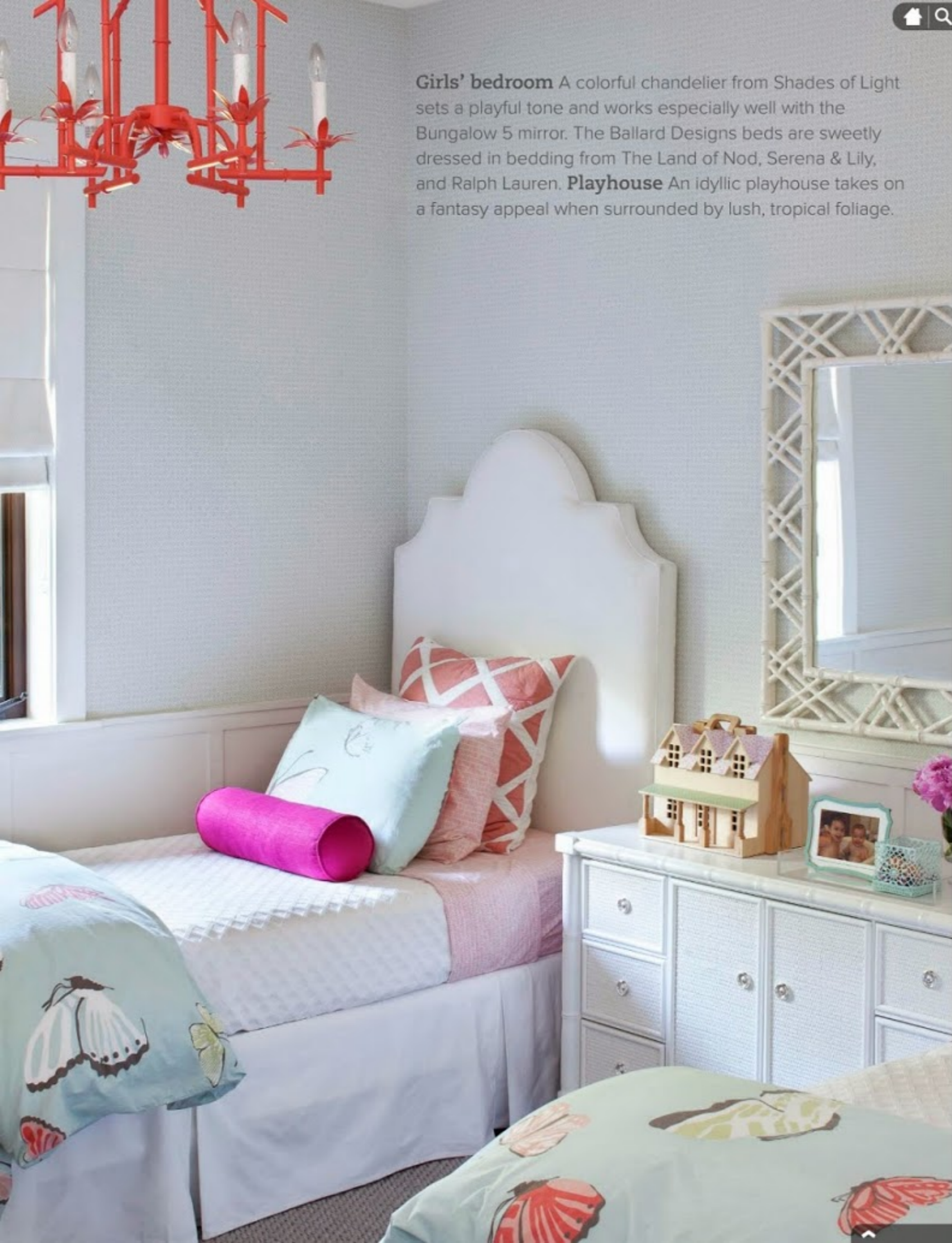
Girls' bedroom A colorful chandelier from Shades of Light sets a playful tone and works especially well with the Bungalow 5 mirror. The Ballard Designs beds are sweetly dressed in bedding from The Land of Nod, Serena & Lily, and Ralph Lauren. Playhouse An idyllic playhouse takes on a fantasy appeal when surrounded by lush, tropical foliage.