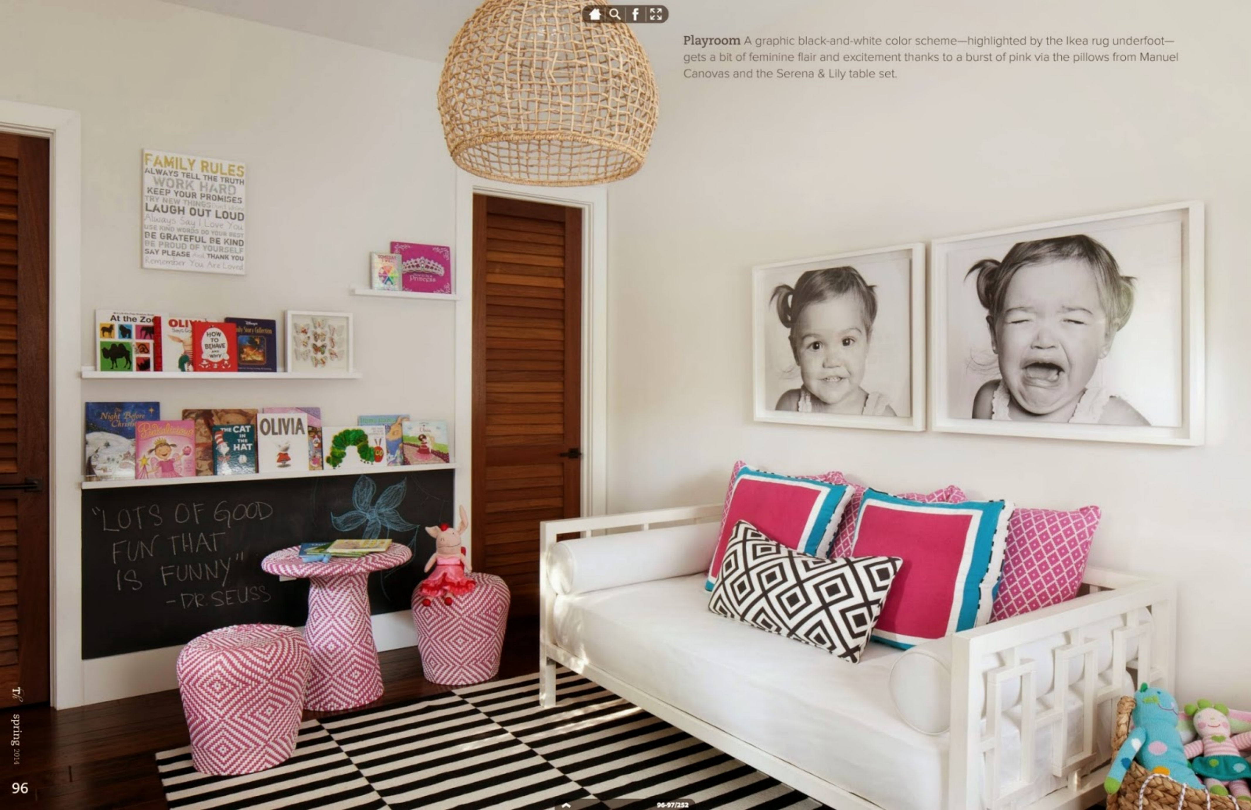
Playroom A graphic black-and-white color scheme—highlighted by the Ikea rug underfoot—gets a bit of feminine flair and excitement thanks to a burst of pink via the pillows from Manuel Canovas and the Serena & Lily table set.