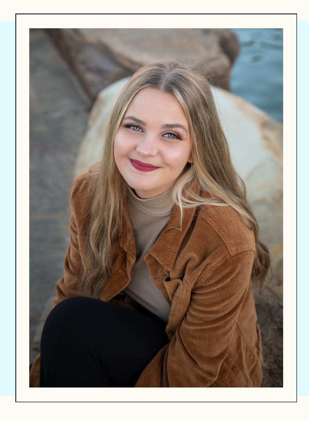
if it's not fun or meaningful, why are we doing it?