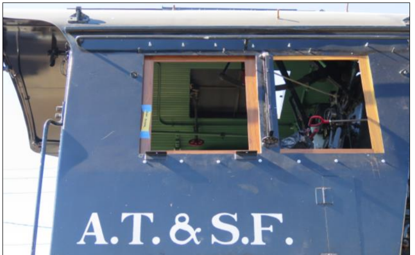
Window Frame Installation: This photo of the right (Engineer's) side of Santa Fe 2926 shows the new walnut window frames during installation.

In future years, it is easy to envision Santa Fe 2926 under steam with Sam Baczkiewicz in the cab, arm resting on nice walnut window frames that he built.