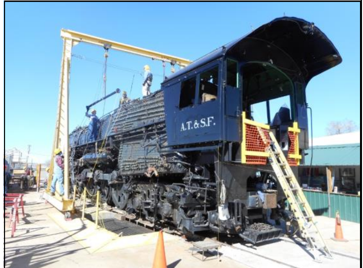
Figure 2: Nearing Completion.

There is still a lot of work to do—hydrotest, insulation and sheet metal installation—but at this year's Open House Santa Fe 2926 will look more like a big locomotive than a rusty relic. Visitors this year can see all the work that has been done—brakes, piping, accessories—and take a look inside the cab at all the new gauges and woodwork.