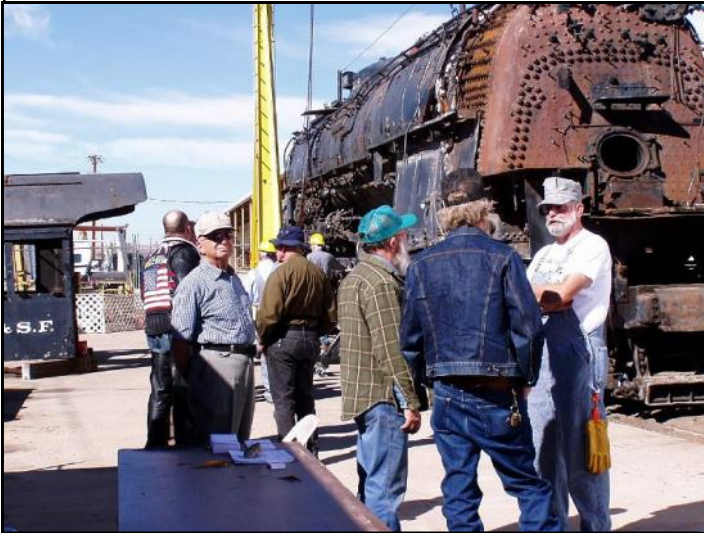
Figure 1: Just Getting The Restoration Underway.

A decade later, the picture is quite different. Folks attending the 2016 Open House will see a much different picture, (Figure 2). After strong, continuing support from around the U.S. and abroad, and more than 140,000 hours of volunteer labor—a total value of more than $2,000,000—reassembly is nearing completion.