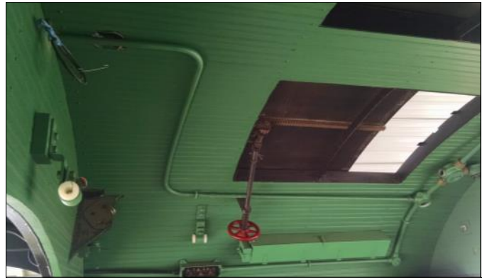
Cab Roof Woodwork w/Sunroof open: This image reveals the curvature and components that made installation a challenge.

There was extensive use of wood in the cab of Santa Fe 2926. Thick pine planks were used in the floor. The cab roof and walls were lined with narrow tongue-and-groove pine. In 1944 when the locomotive was built, molded paneling, plastic, plywood, etc. were not in wide use. Thus, the tongue-and-groove served two purposes. It fit snugly on curved surfaces, and allowed for expansion and contraction. Installation of that woodwork was described in a previous newsletter, (Vol. XII No. I, Jan-Feb-Mar, 2013). Pine was used for the replacement. The tongue and groove work, performed by Randy and his woodwork team, was intricate and required a lot of volunteer hours of labor. It is pictured at right after it was painted in the original cascade green.