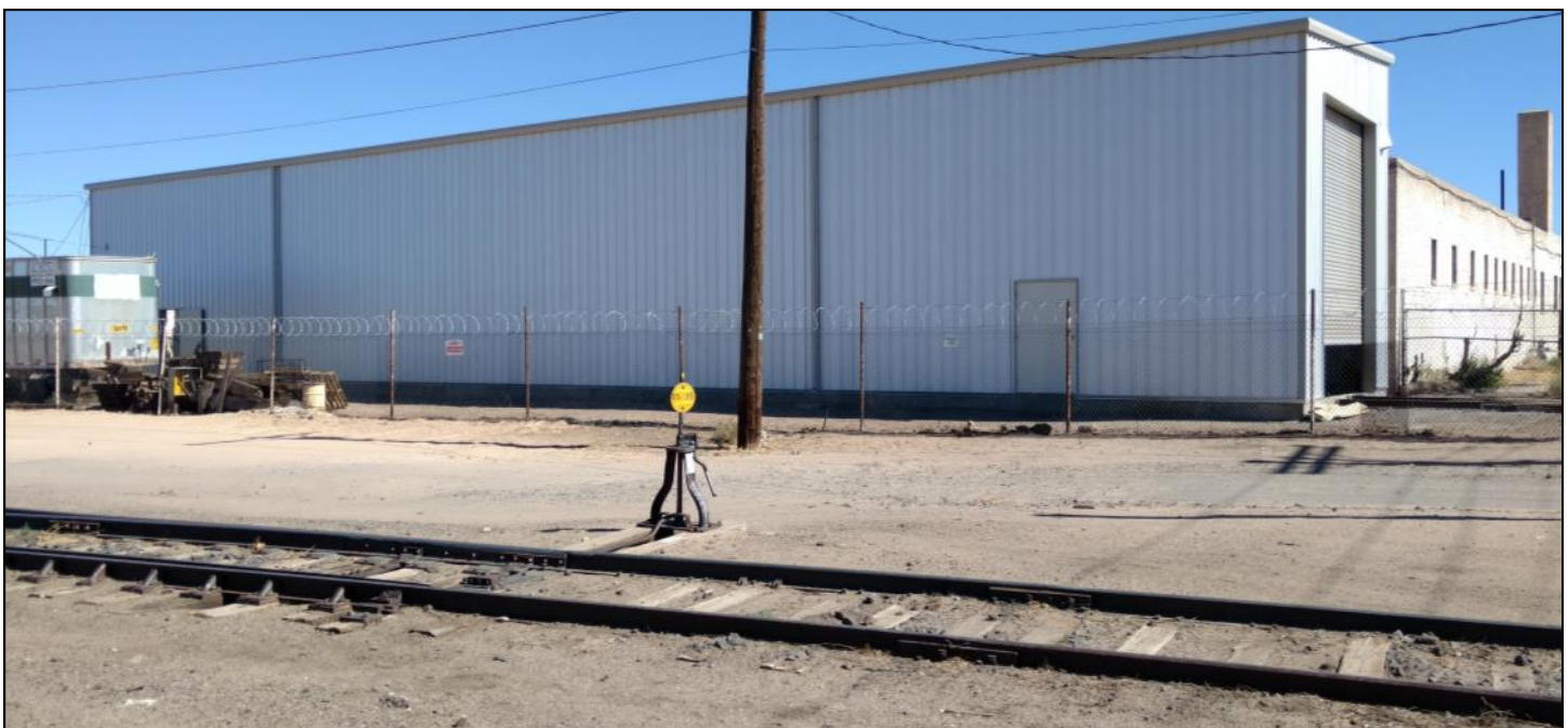
Santa Fe 2926 Engine Shed: This picture shows the new engine shed as appears to anyone traveling north on 8 th St NW at the crossing of the Sawmill Rail Spur. The building at extreme right is a BIA warehouse.