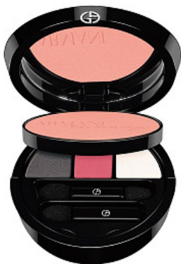
Giorgio Armani Runway Palette