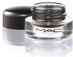
Mac Cosmetics Fluid Line