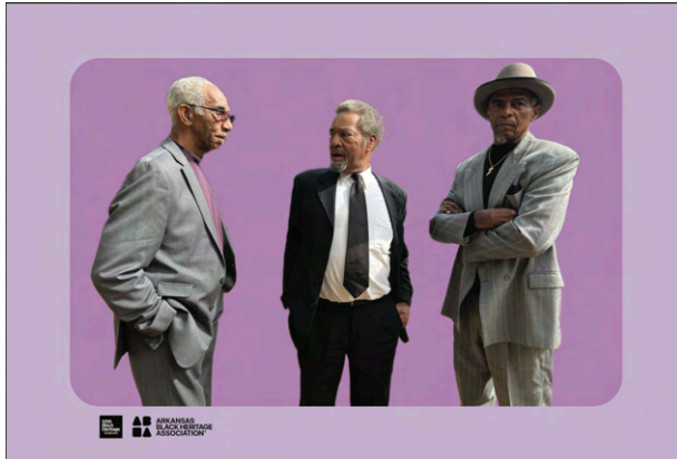
Three longstanding elders raised in the Black historic district