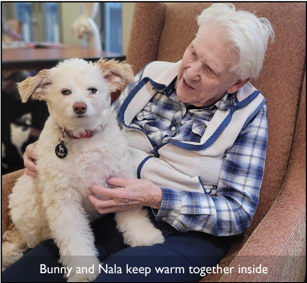
Bunny and Nala keep warm together inside