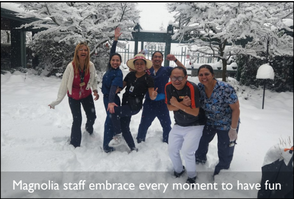
Magnolia staff embrace every moment to have fun