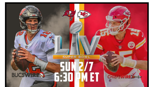
Feb 7 | CBS 3:30 pm (PT) Kick Off All House TVs should be tuned in!