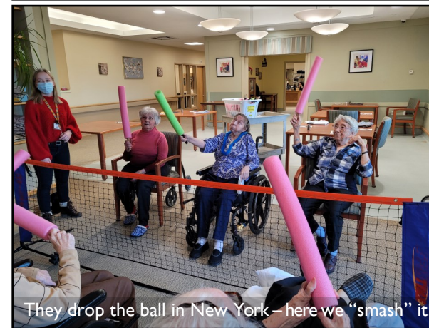
They drop the ball in New York - here we "smash" it!