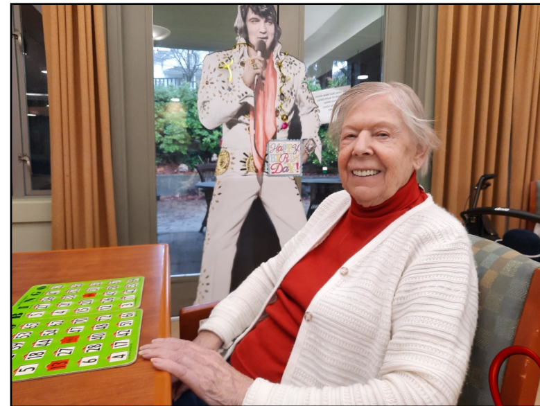
FRIDAY BINGO Feb 5, 12, 19 and 26 1:30 pm in Willow and 3:30 pm in Magnolia