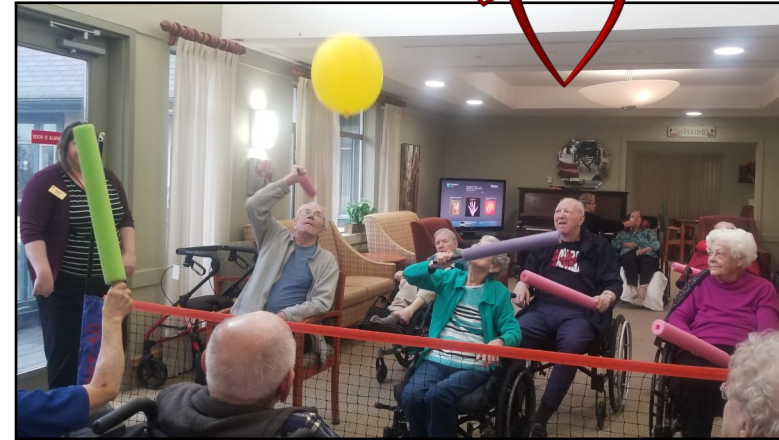
TUESDAY TENNIS at 2 pm Feb 2 - Willow, Feb 9 - Rose Feb 16 - Willow, Feb 23 - Rose.