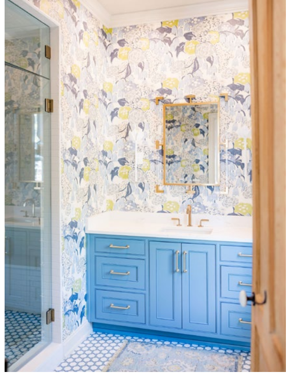
TOP, LEFT AND RIGHT: Bold color and pattern choices are widespread in the children's bedrooms. Each space is personal to the child. Bright blue and crisp white are a classic touch. Mary persuaded the Reeds to make daring choices in wallpapers and tiles that pushed their comfort zones for the children's spaces, and the couple is thrilled with the results.