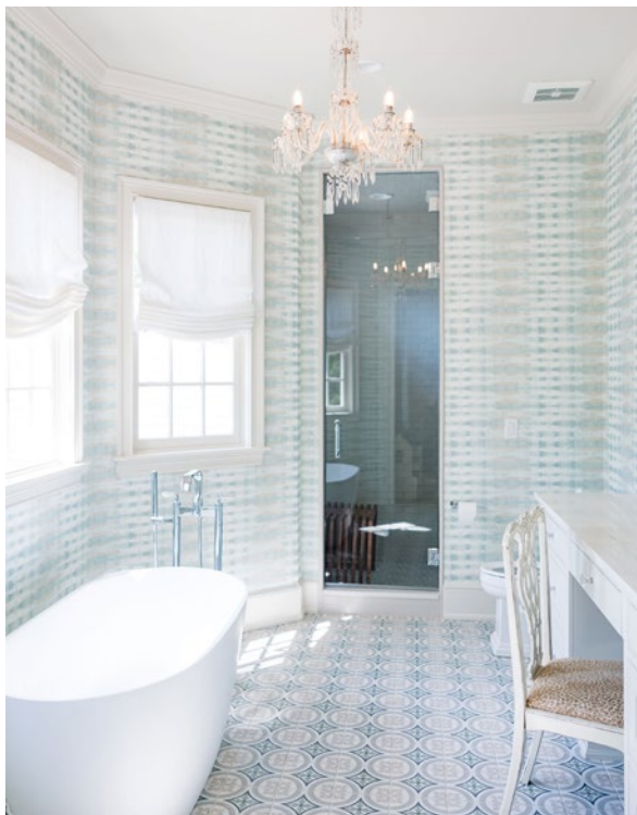
BOTTOM, LEFT AND RIGHT: Soft patterns create a relaxing bathroom retreat. Corrie inherited a variety of crystal chandeliers that Mary integrated into the home. "This was another perfect way to incorporate the old with the new in this home," the designer notes. A daughter's bedroom is a delight in floral with contrasting patterned fabrics.