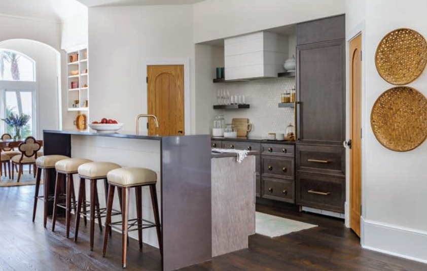
Above left: Cloverleaf chairs gather around a game table in the den. Top: The den is amply furnished for the family and their friends to watch a movie or ballgame together. Above: The kitchenette is handy for grabbing drinks and snacks.

photographer who had taken pictures of the famous wild horses on Cumberland Island, and we commissioned a piece," she says.