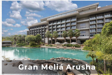
Gran Meliá Arusha