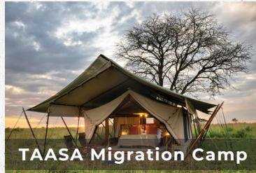
TAASA Migration Camp