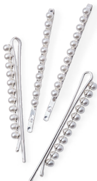
Icing Faux Pearl Occasion Hair Clips , icing.com , $10