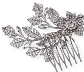
Charming Charlie Special Occasion Flower Comb , charmingcharlie.com , $13