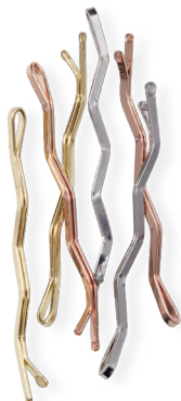
Scünci Small Zig Zag Bobby Pins , ulta.com , $9