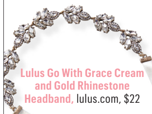
Lulus Go With Grace Cream and Gold Rhinestone Headband , lulus.com , $22