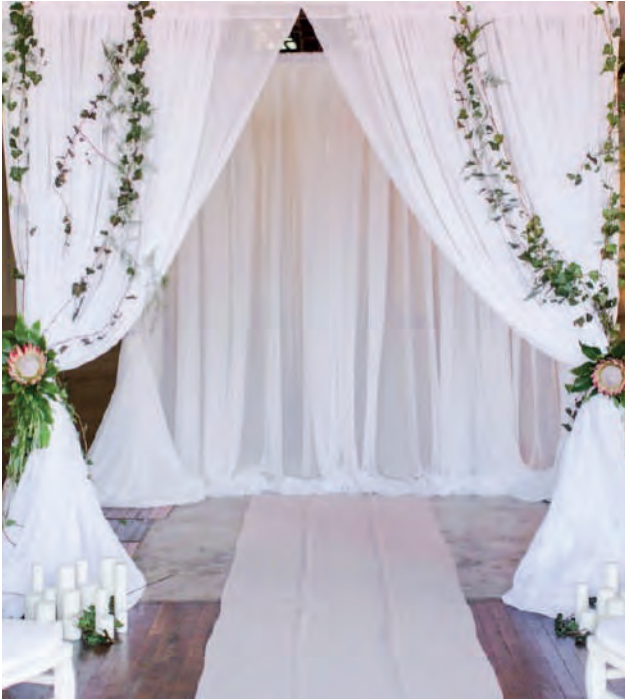
4 POST CANOPY Multiple colors available