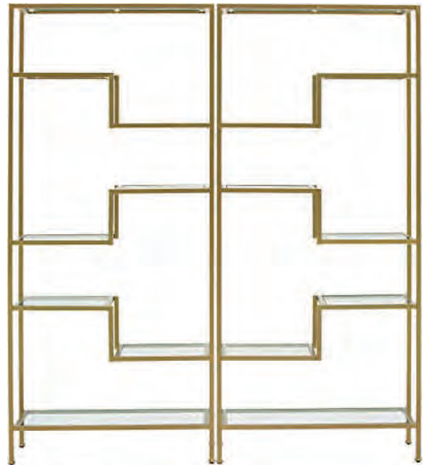
LUCERNE - Gold Geode 2-piece Bar Back 12.5" x 70" x 78"