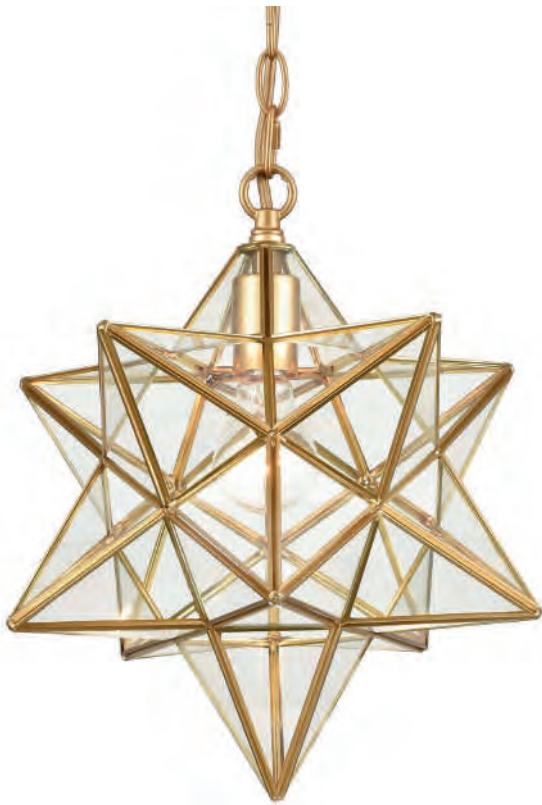
GOLD STAR PENDANT