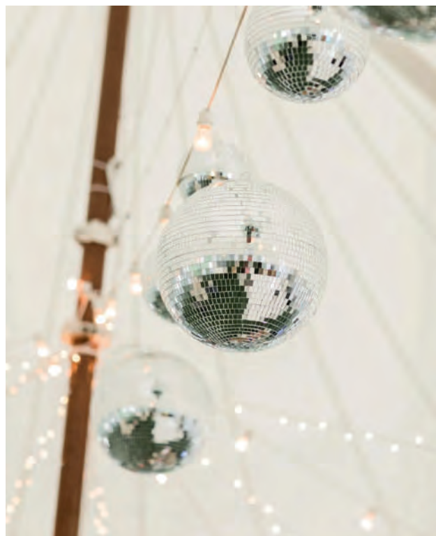
DISCO BALL - AVAILABLE IN DIFFERENT SIZES