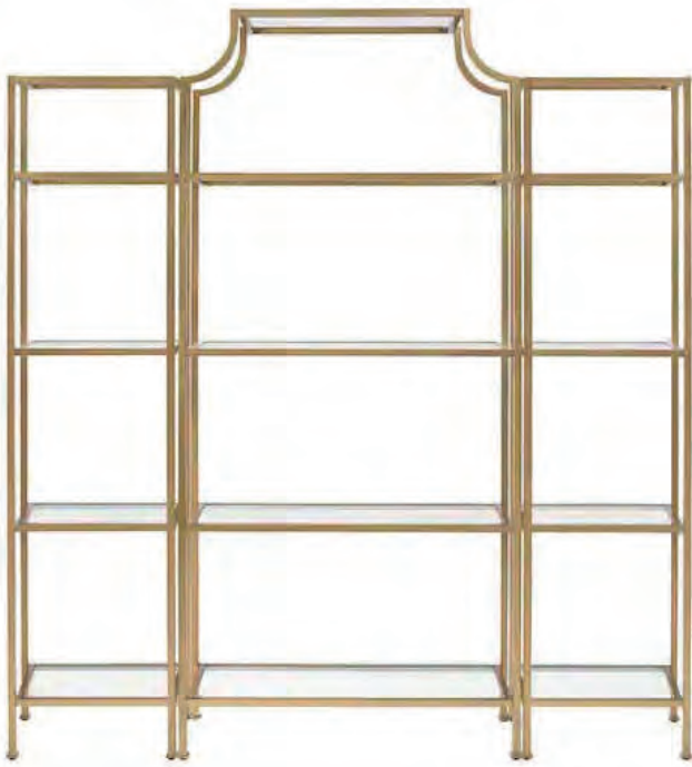
DUBLIN - Gold Bar Back (1 Piece or 3 Piece Option) 18" / 36" / 18"