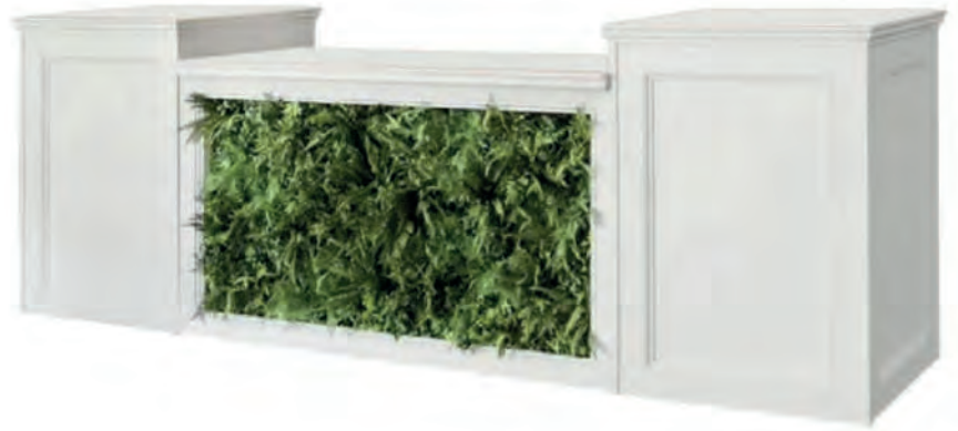
LOVE BARCELONA– 12' Greenery Bar with Pedestals Features faux greenery front insert. Customizable panel insert: acrylic, fabric & wallpaper. 146" L x 32" W x 45" H