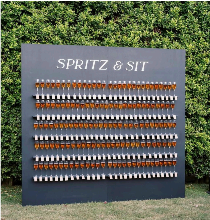
CAPRI - 8' x 4' Wall with shelves (or add an additional quantity for 8' x 8') Available in black and white