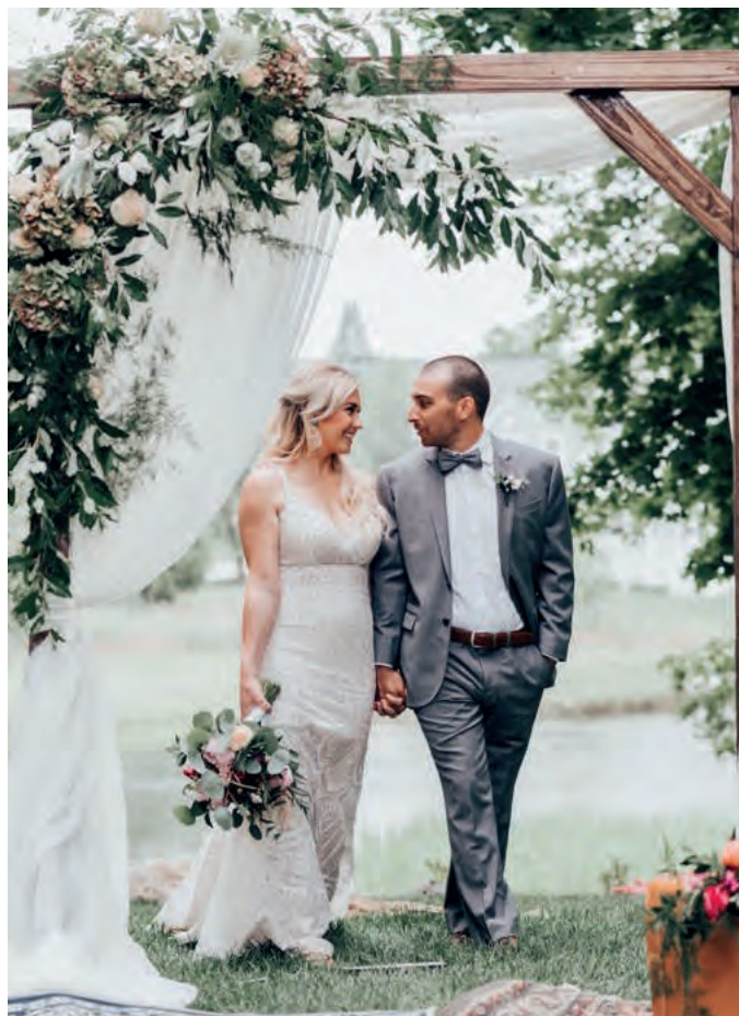
WOODEN ARCH & DRAPING