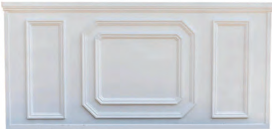
MADRID – 6' White Bar Customizable panel insert: acrylic & wallpaper. 74" L x 32" W x 42" H