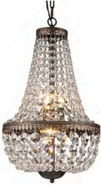
1.5' CRYSTAL EMPIRE CHANDELIER