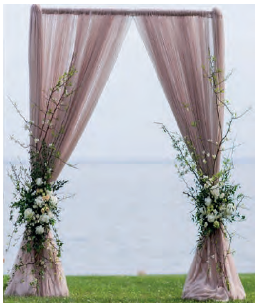
2 POST SINGLE LAYER Arbor