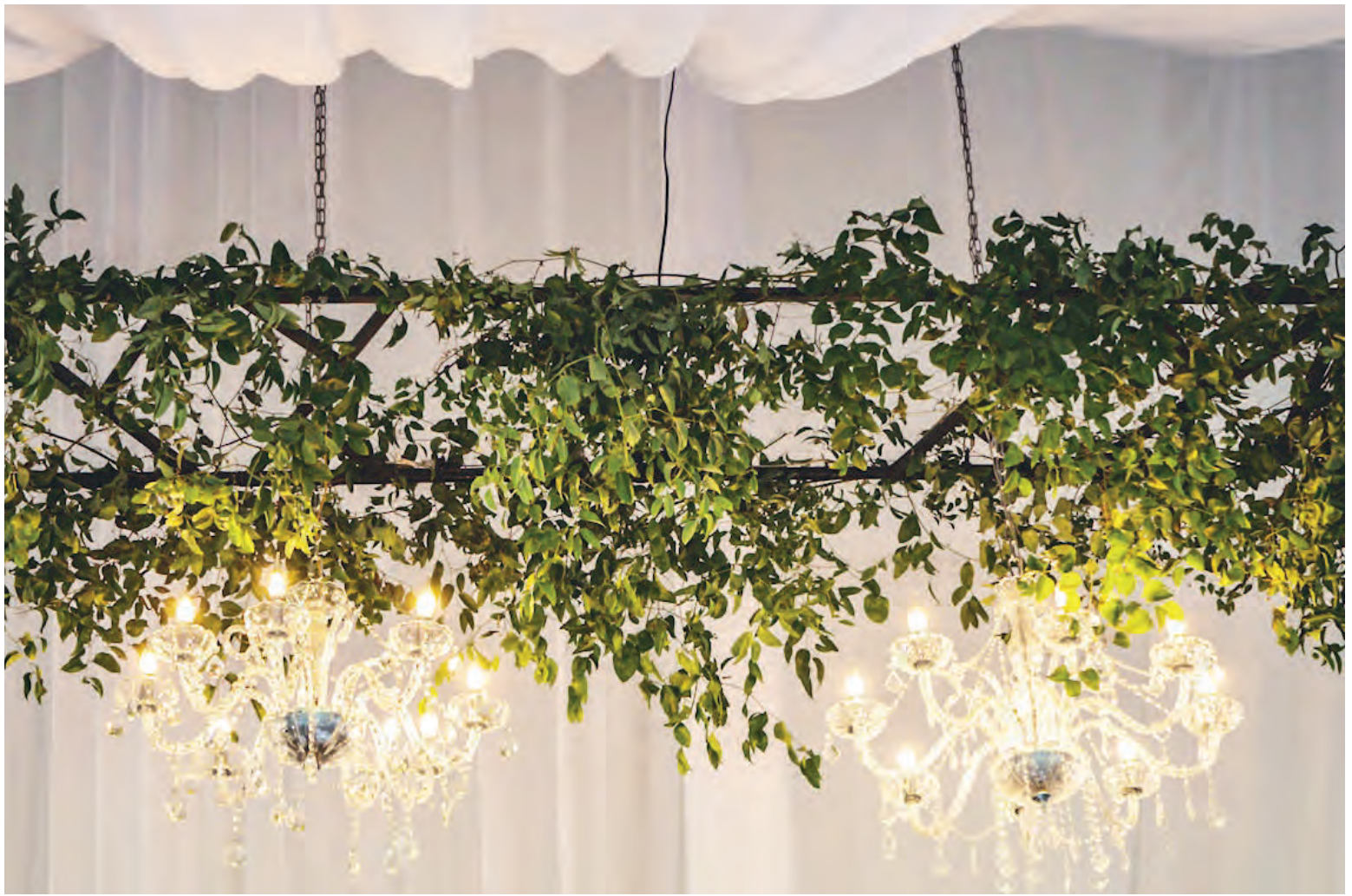
9' X 3' Structure with 2 Crystal Chandeliers & Fresh Greenery