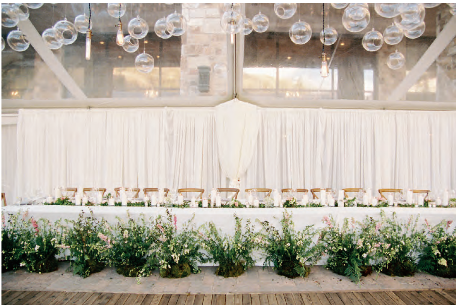
Wall Draping - Up to 10' H