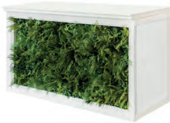
BARCELONA – 6' Greenery Bar Features faux greenery front insert. Customizable panel insert: acrylic, fabric & wallpaper 74" L x 32" W x 42" H