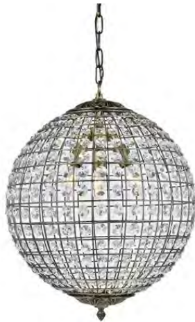
GLOBE CRYSTAL CHANDELIER