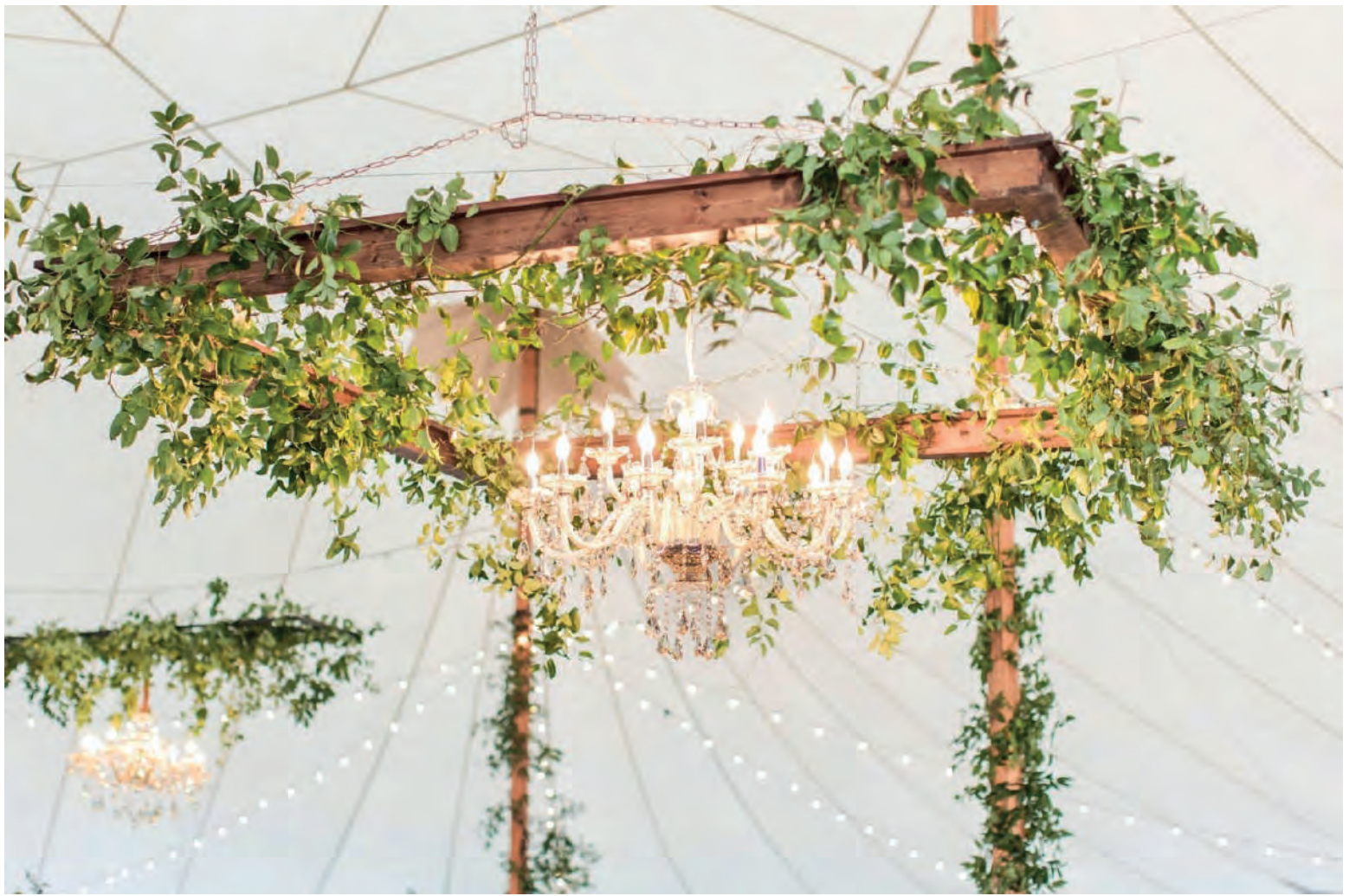
9' x 9' Structure & 15 Light Crystal Chandelier