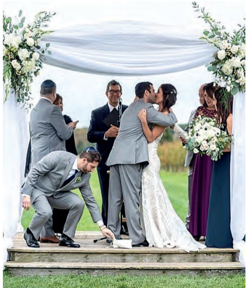
CHUPPAH 8' 4-Post with Full Draping