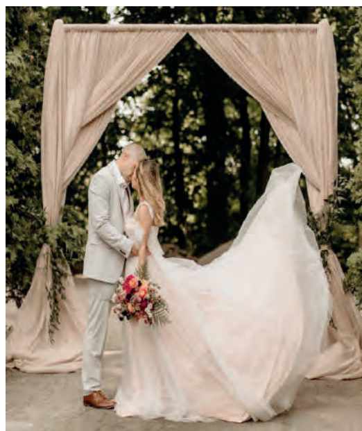
2 POST MULTI-LAYER Arbor