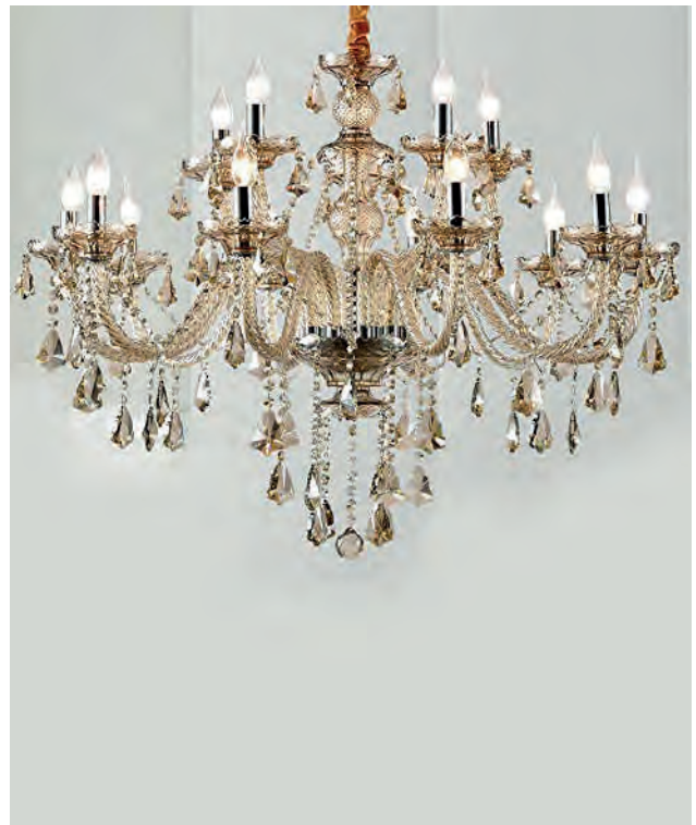
15 Arm/Lights Chandelier