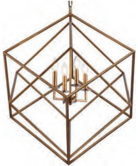
HEMISPHERE GOLD GEODE CHANDELIER