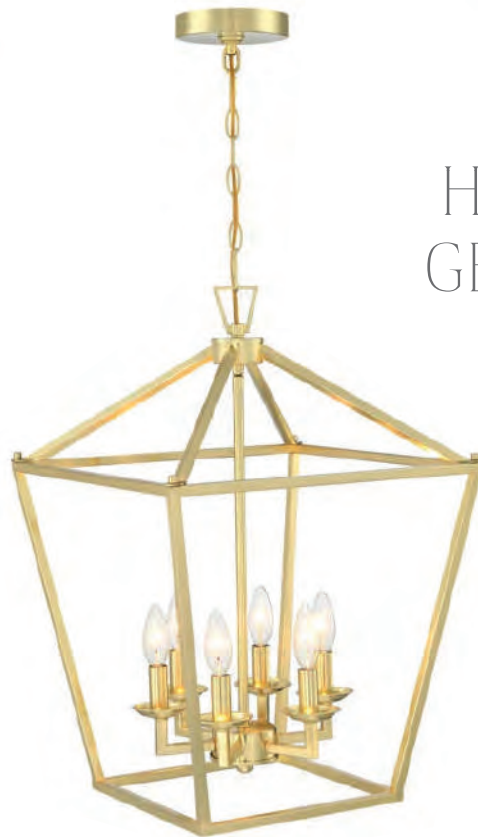
GOLD LANTERN CHANDELIER