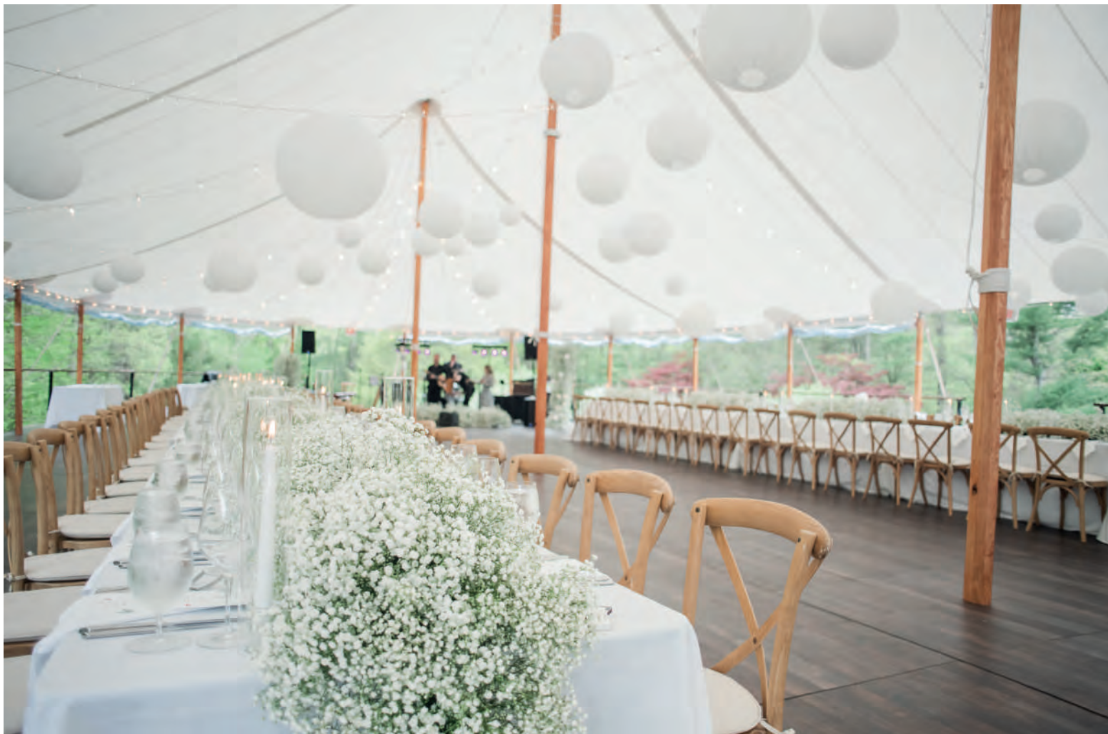
ASSORTED PAPER LANTERNS