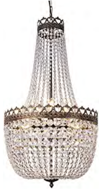
3' CRYSTAL EMPIRE CHANDELIER