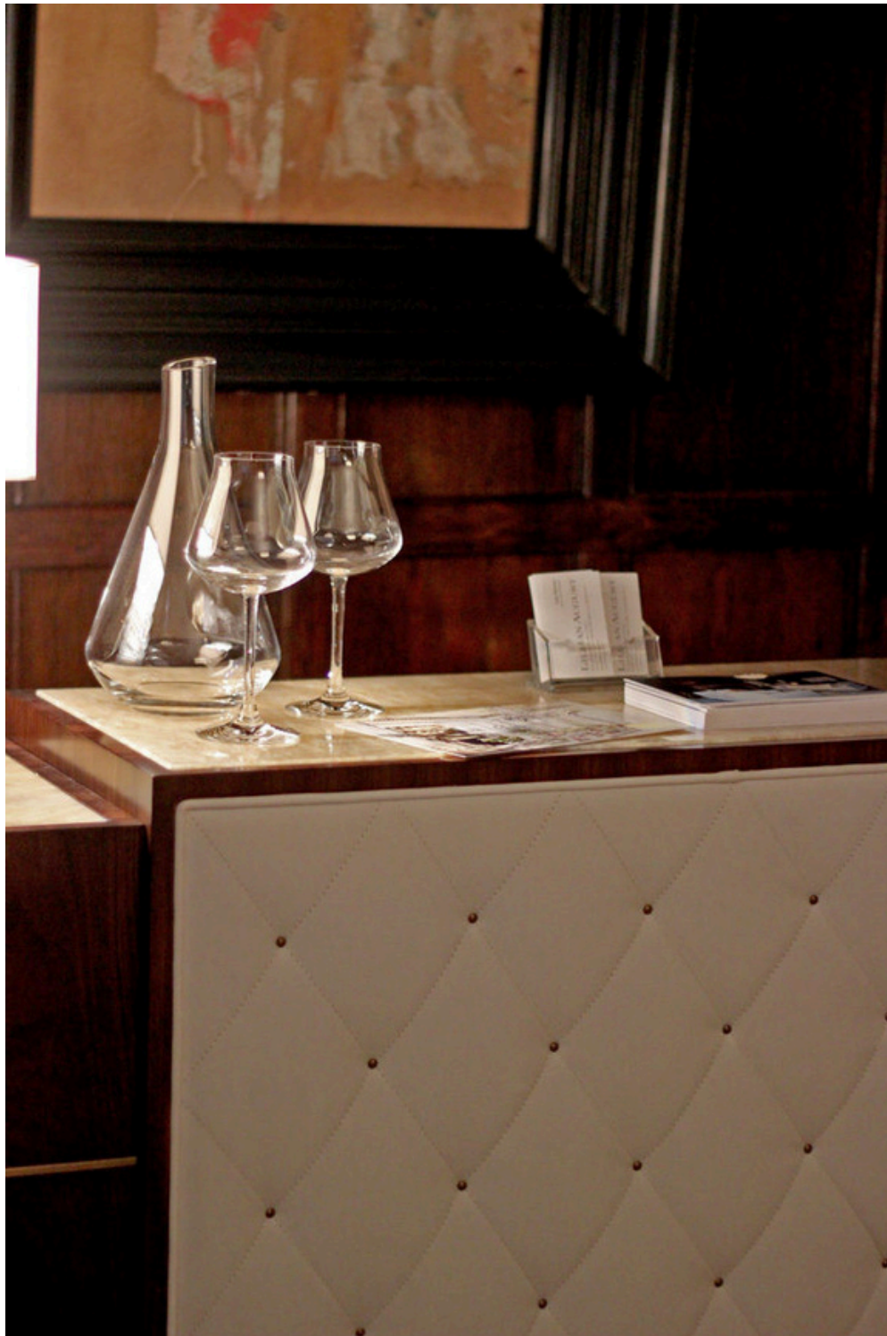
They covered the front of the bar with this tufted white fabric – more white and more femininity to contrast with all of that dark wood.