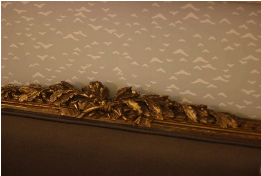
And a gorgeous bench to match...the deep color offset some of the femininity of the room.