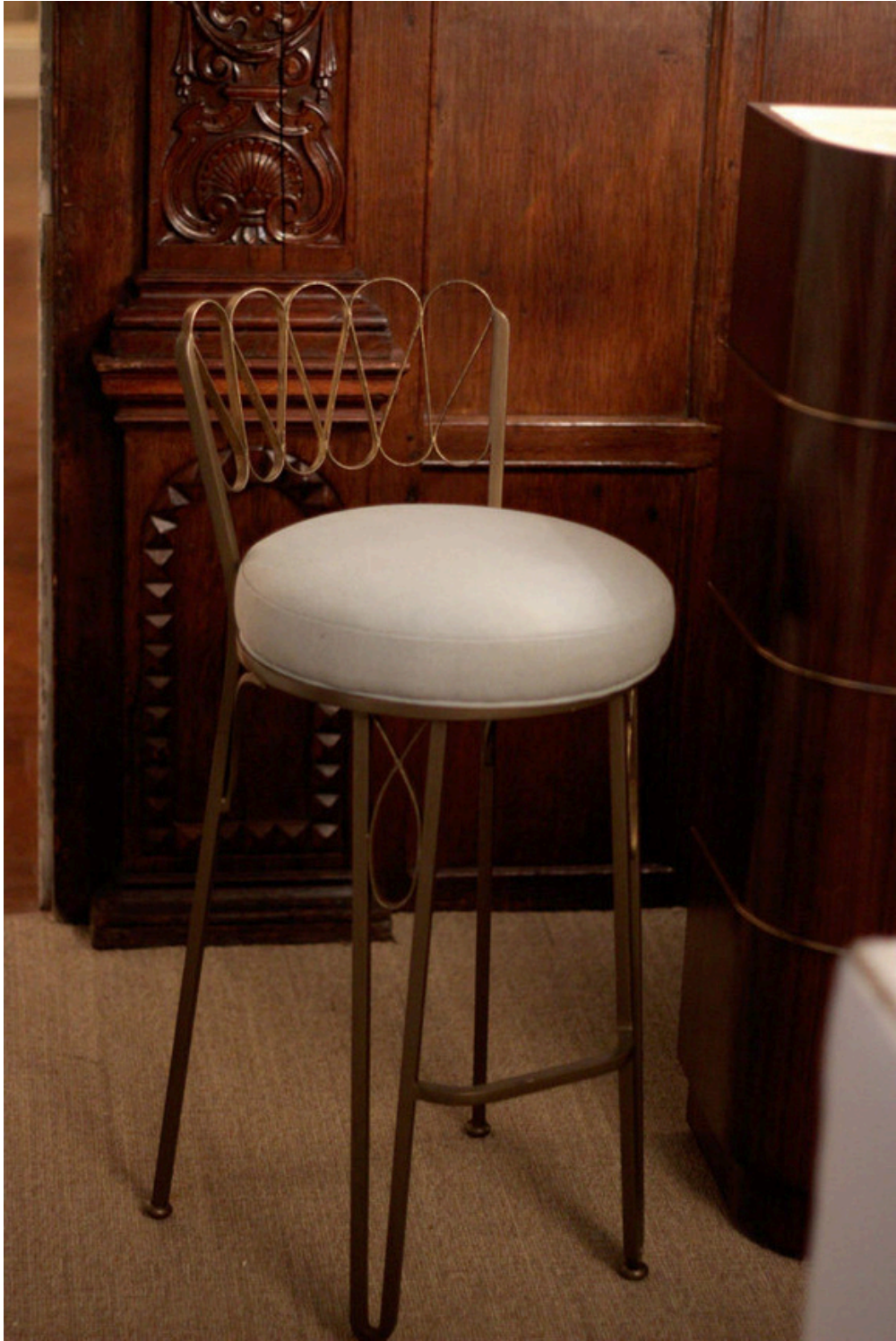
A lovely and delicate bar stool.