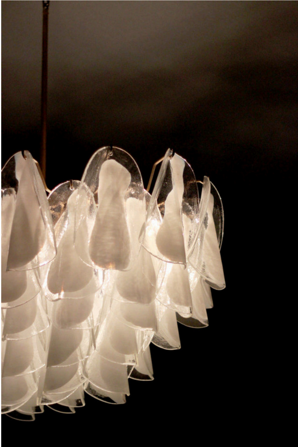
An interesting and beautiful light fixture.