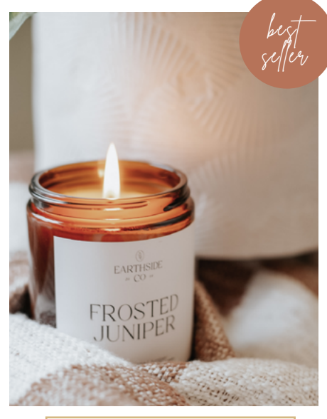
$30 | Frosted Juniper Candle