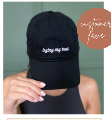
$25 | "trying my best" cap