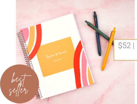
$52 | 12-Month Undated Planner