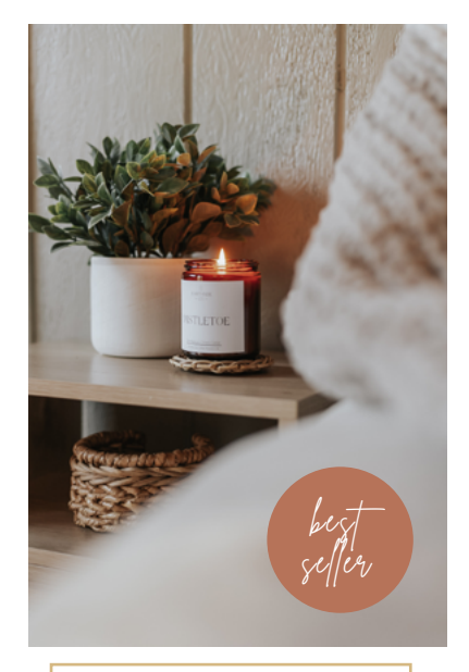
$24 | Mistletoe Candle