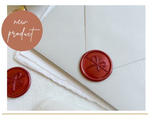
$14.25+ | Christmas Bow Wax Seal Set