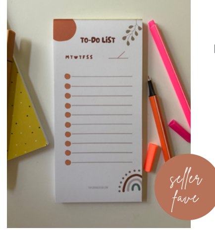
$12 | To-Do List Notepad