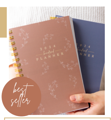
$42 | 2024 Kindred Planner

Our other stationery and merch items are printed on demand to prevent overprinting/over production. Stationery items are printed on 100% recycled paper and merch items on ecofriendly organic cotton.