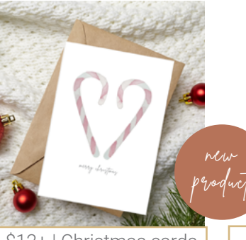
$12+ | Christmas cards