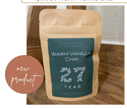
$9.95 | Warm Vanilla Chai