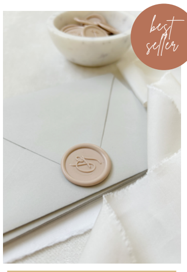
$14.25+ | Calligraphy Initial Wax Seal set