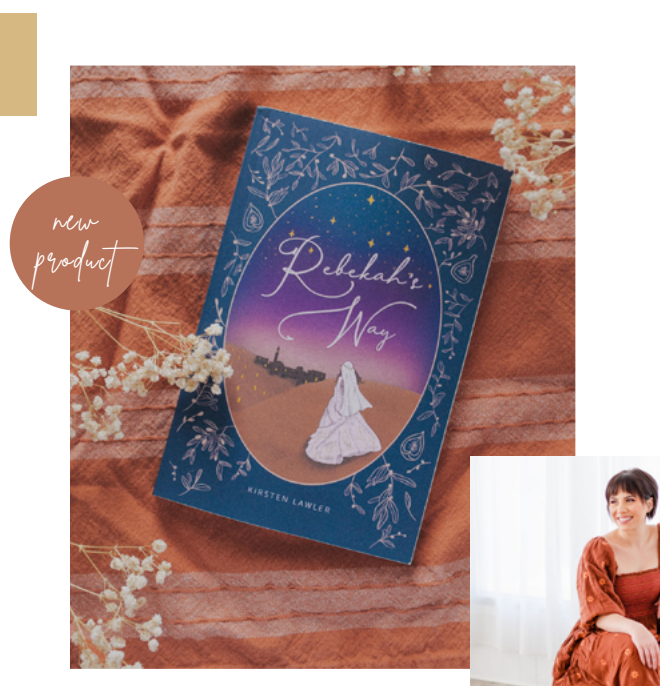
$12.99 Paperback I $3.99 Kindle

I have started reading this book and it is so good. If you like Francine Rivers, you'll like this book.