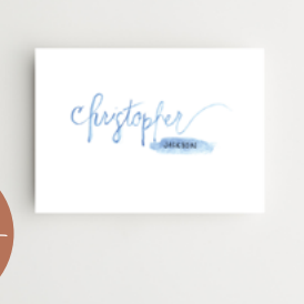
$10+ | Custom envelopes (watercolor + hand lettered)