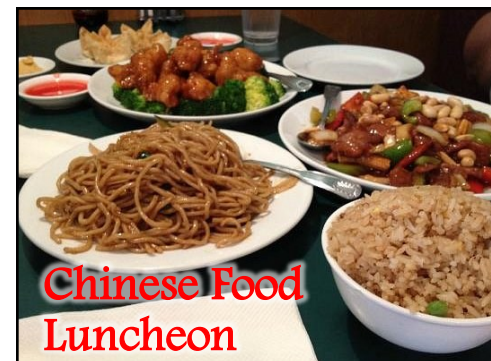
Chinese Food Luncheon

Christmas Special Dec. 9 - Monday, 2 pm MPR Dean Martin & Frank Sinatra Christmas Special