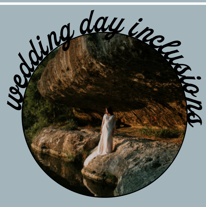
Facility Rate + $2,000 Cypress Falls Requires in-house coordination