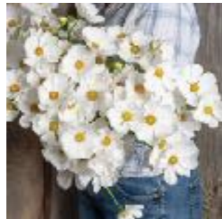
Cosmos, Afternoon White