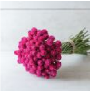
Qis Carmine Gomprena