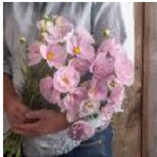
Cosmos, Cupcakes Blush