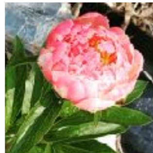
Peony, Bridal Bouquet