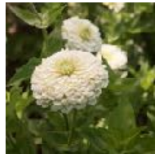
Zinnia, Benary's Giant White