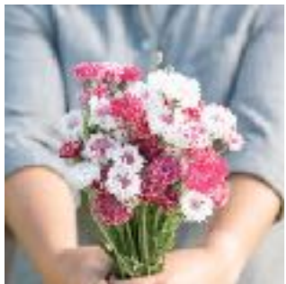
Centaurea, Classic Romantic