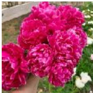
Karl Rosenfeld peony