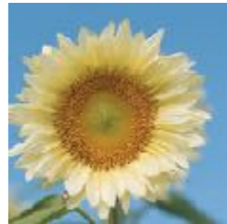
Sunflower, Procut White