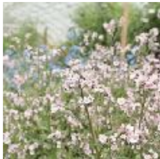
Cynoglossum, Mystery Rose