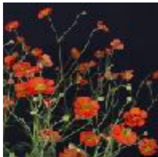
Geum Scarlet Tempest