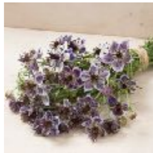
Nigella, Delft Blue