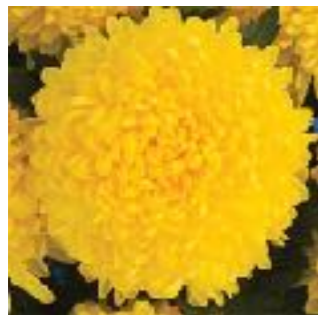
Chrysanthemums, Golden Gate