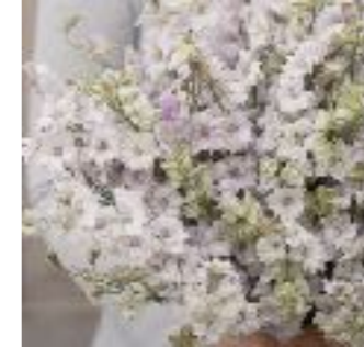
Fancy Smokey Eye Larkspur