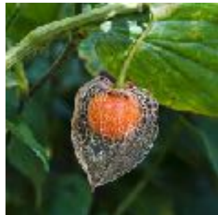
Chinese Lantern vine