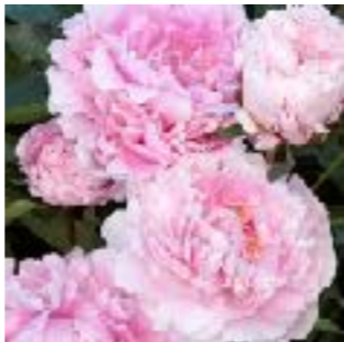
Peony, Pink bouquet