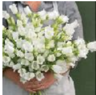
Campanula, Champion White