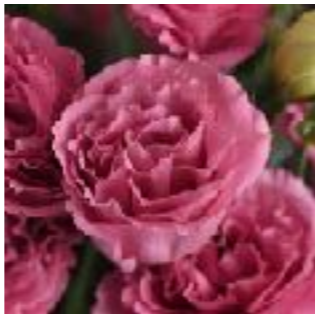
Rose group 2, Lisi ABC