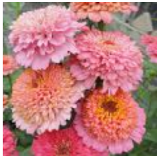
Zinnia, Cupcakes Pink