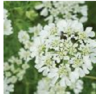
Orlaya, White Finch