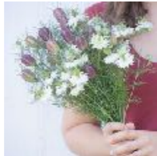
Nigella, Albion Black Pod