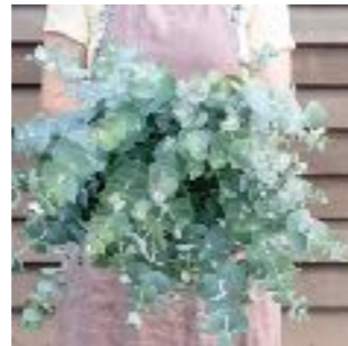
Silver Dollar Eucalyptus