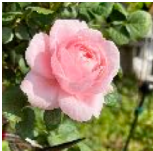
DA Rose, Queen of Sweden