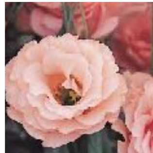
Apricot, group 3 lisi arena