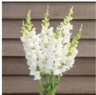
Snap Dragon, Costa Midly White