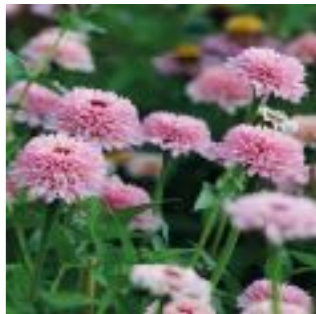
Zinnia, Zinderella Lilac