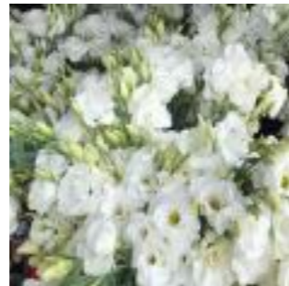
Lisianthus, Pure White Mariachi