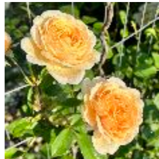
Rose, Charles Darwin