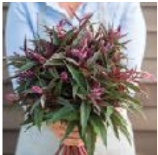
Celosia, Flamingo Purple