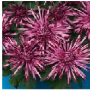
Chrysanthemum, Pittsburgh Purple