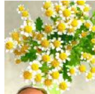
Feverfew Vegmo Single