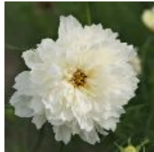
Cosmos, Double Click White Knight