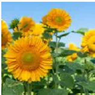
Procut Gold Lite