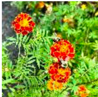
Bright Orange Marigold