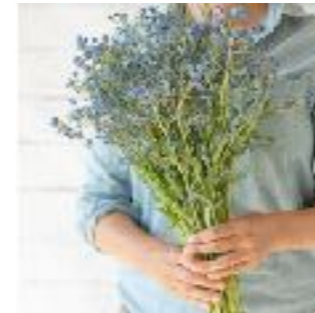
Forget me nots, Cynoglossum