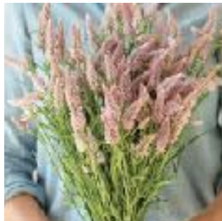
Celosia, Flamingo Feather