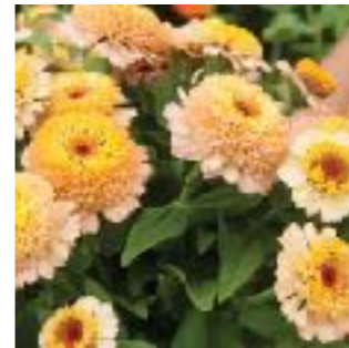
Zinnia, Zinderella Peach