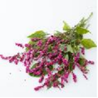
Kiss Me Over The Gardent Gate