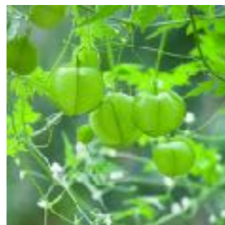
Love in a puff