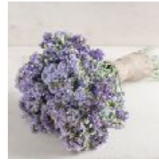
Statice, Seeker Pastel Blue