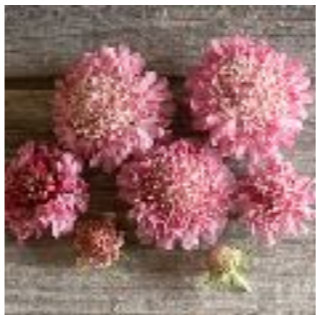
Scabiosa, Salmon Rose