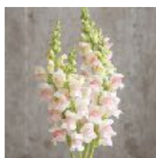
Snapdragon, Potomac Apple blossom