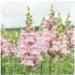
Snap dragon, Opus Lavender