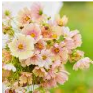
Cosmo, Apricot Lemonade