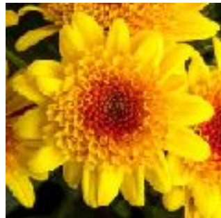
Chrysanthemums, Key Largo Golden