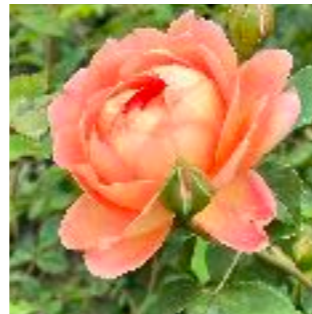
Roses, Lady of Shallot