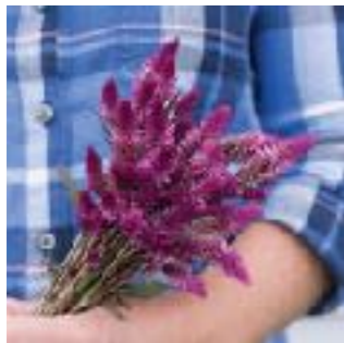
Celosia, Ruby Parfait