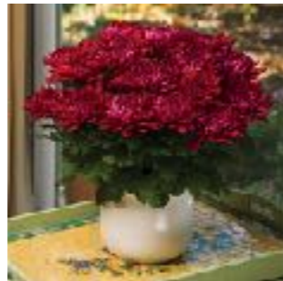
Chrysanthemums, Delano Purple