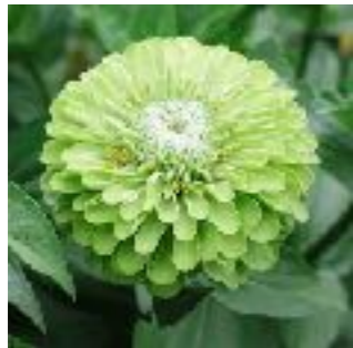
Zinnia, Tequilla Lime