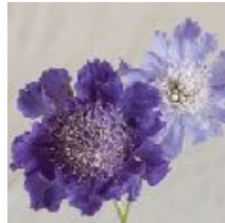
Scabiosa, Fama, Deep Blue