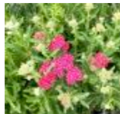
Dark Pink Yarrow