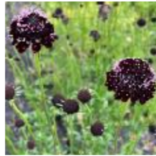
Scabiosa, Black Knight