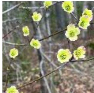
Native Dogwood Branches