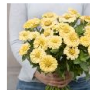
Creamy Yellow-Giant Dahlia