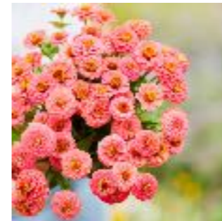
Zinnia, Lilliput Salmon