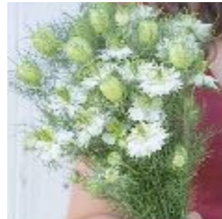
Nigella, Green Pod