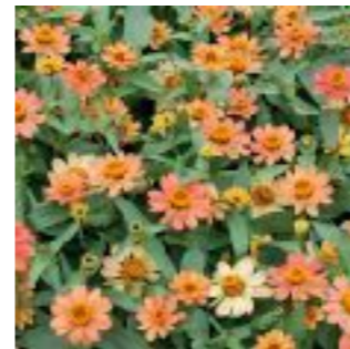
Zinnia, Profusion Apricot