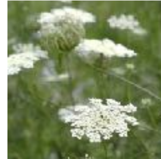
Queen Anne's Lace