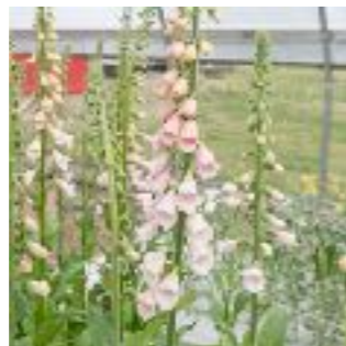
Digitalis, Pink Gin