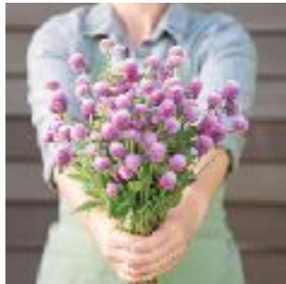
Gomphrena, Audray Pink