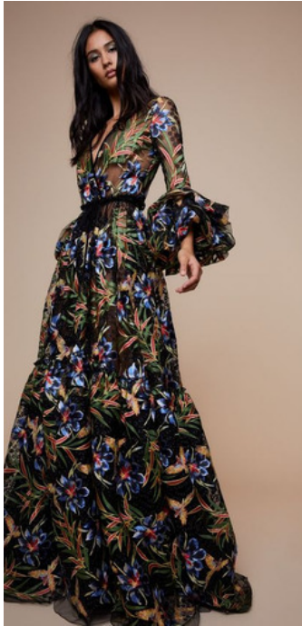
Diane von Furstenberg