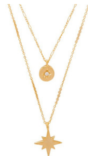
Five And Two