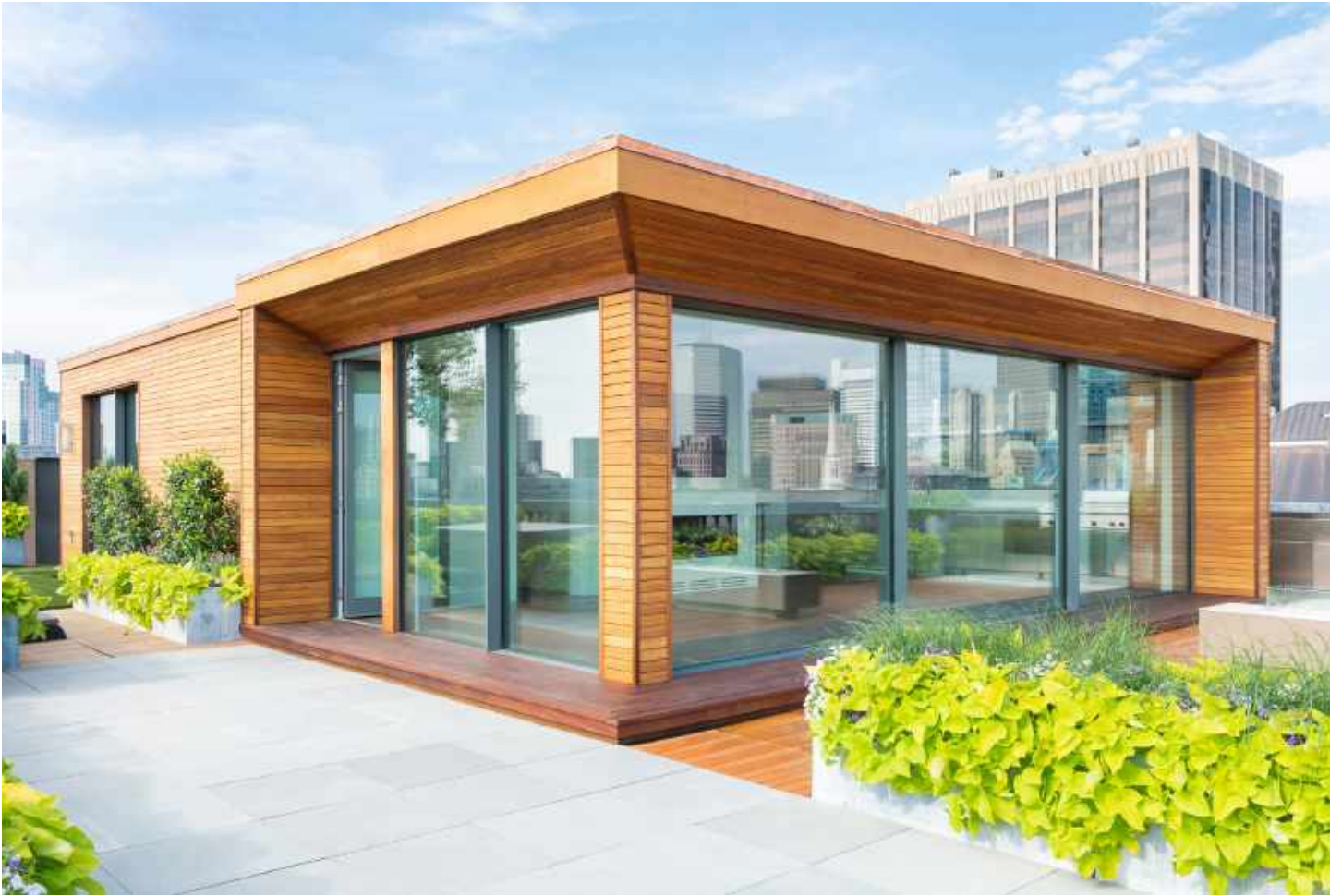
Right: As built