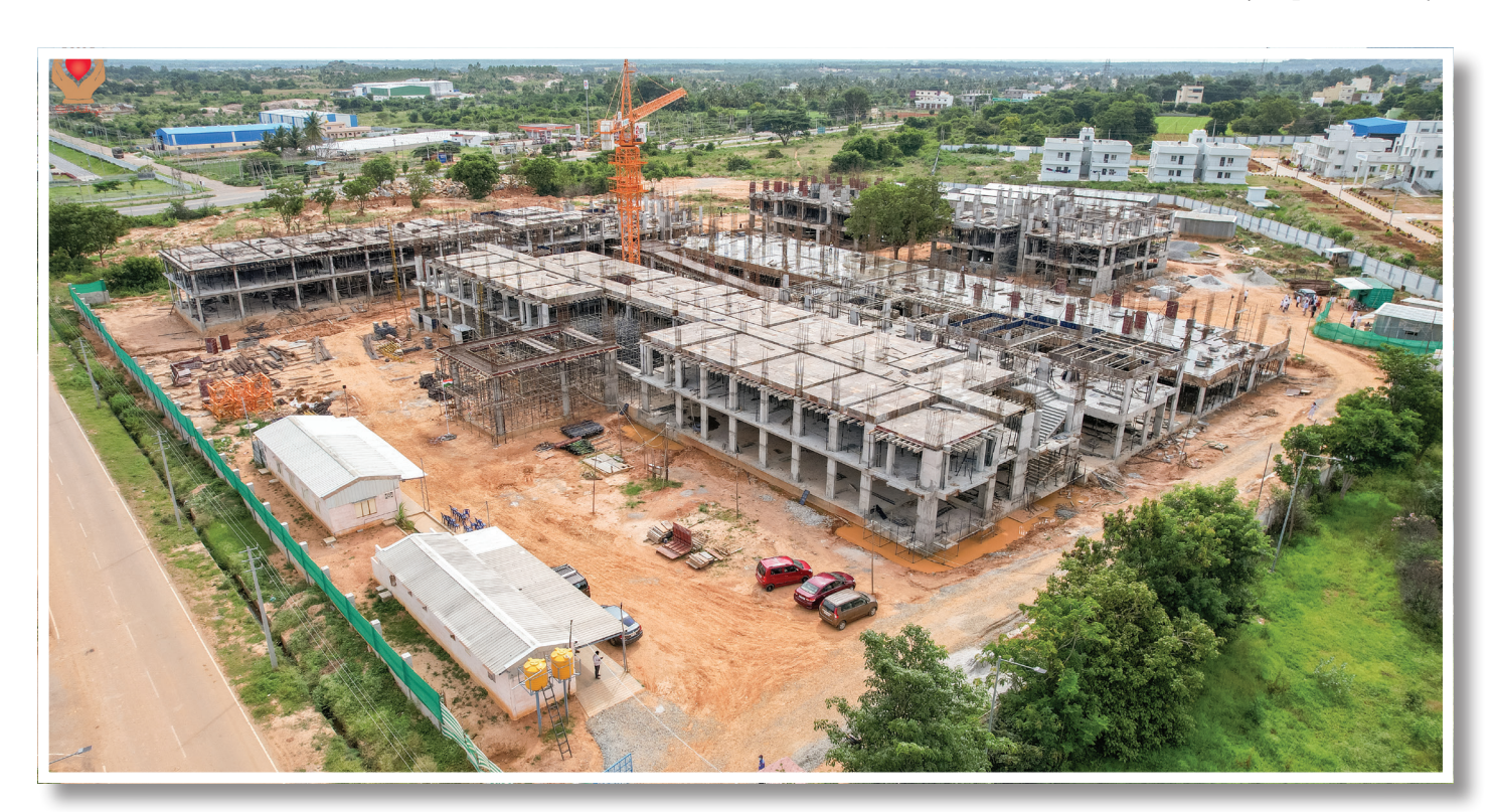
Aerial View of our Hospital shot on 15th August, 2022

guidance we have been receiving from Government authorities both Central and State, multiple companies both public and private, Foundations carrying out Seva have been giving us the impetus we need at every stage of the project.