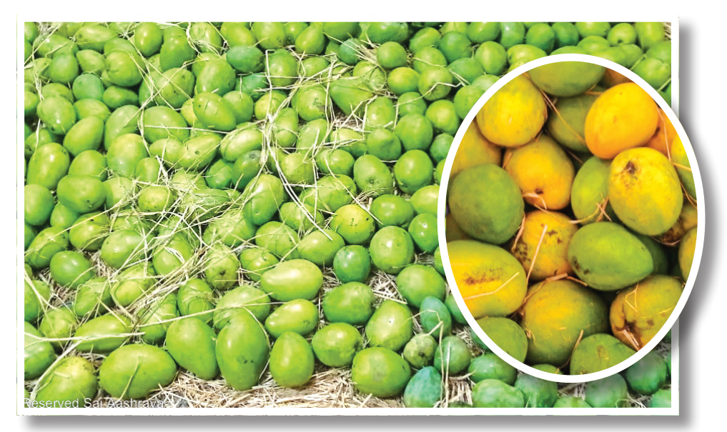
Fresh from the farm - Ready to be served with Love

The latest developments this way saw us save a lot of cost and more importantly time. We are pleased to share that we will now be completing the project well ahead of schedule thanks to the modern technologies available in constructing the inner walls (non-load bearing) in one third the time we had planned. Similarly, we have been making breakthroughs in all the departments in the construction of our hospital ensuring that we are always on track. The support and