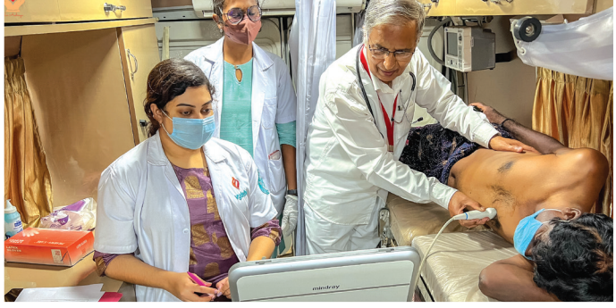
A smile from the heart - Our Motivation