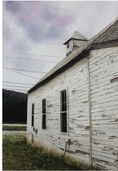
Eternal © Alan Shuptrine