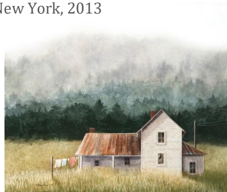
Cadence © Alan Shuptrine