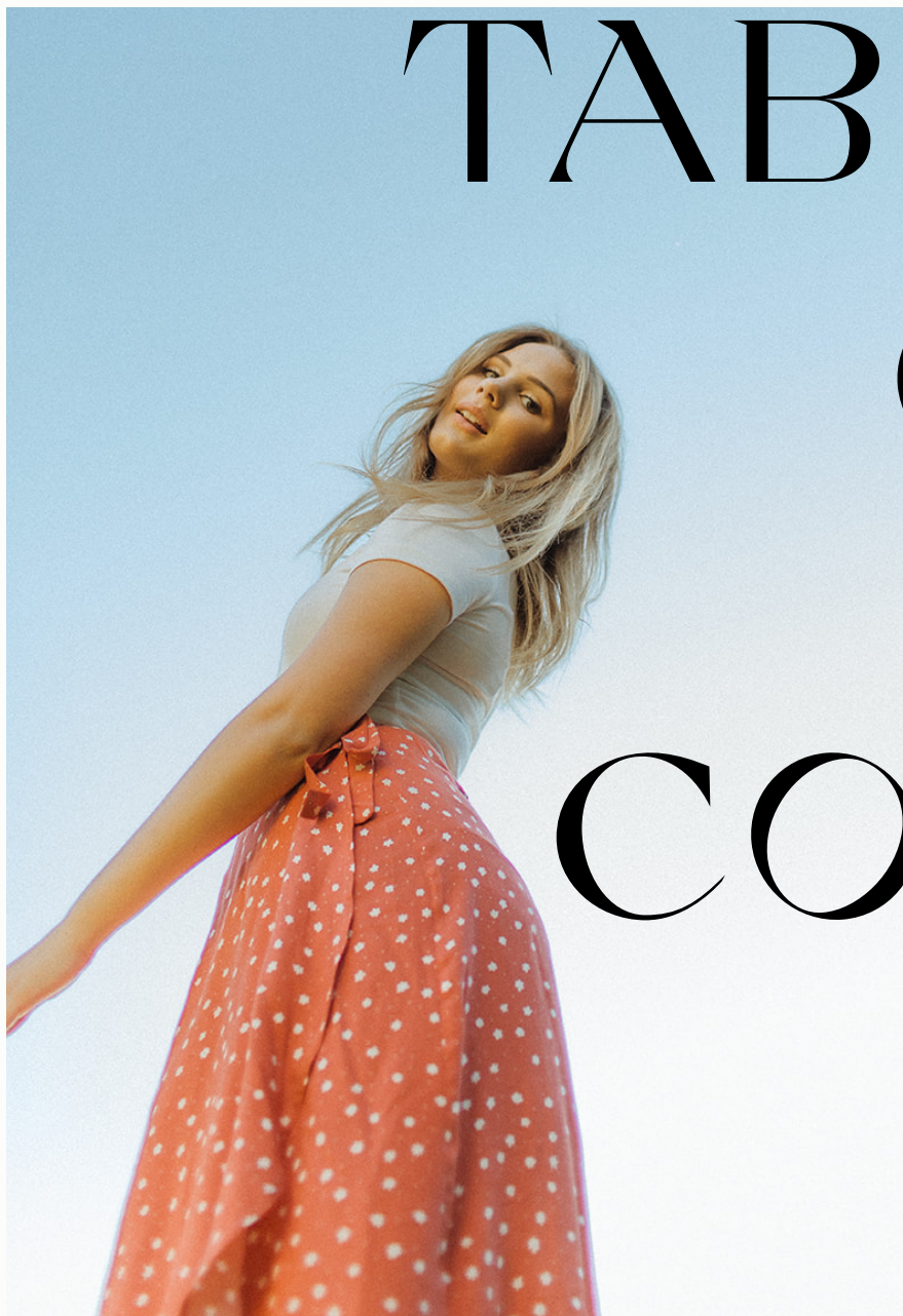
TABLE OF CON- TENTS