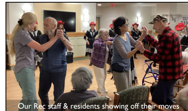
Our Rec staff & residents showing off their moves