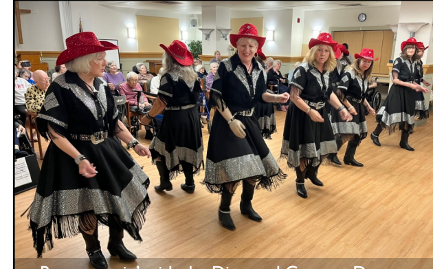
Boot scootin' with the Diamond Country Dancers