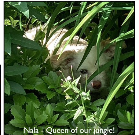
Nala - Queen of our jungle!