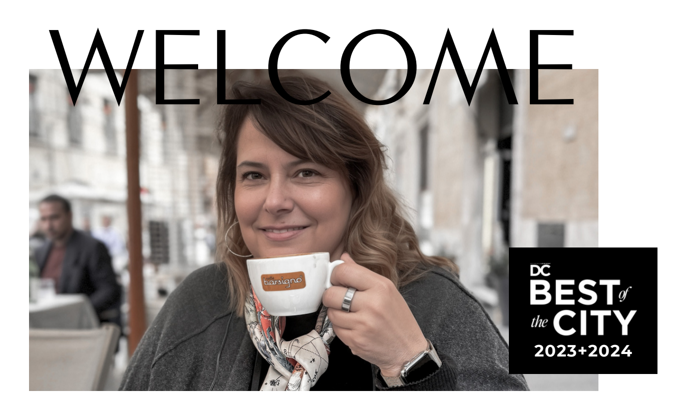
SO GLAD YOU'RE HERE

Here are my current cherished travel essentials. These invaluable resources are your ticket to exploring the globe like never before — much like our clients' experiences.