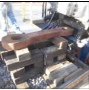
Installing a drawbar at the rear of AT&SF 2926.

ABOVE: Preparing For The 2017 Open House: A couple of work sessions prior to the Open House are dedicated to cleanup and preparation. It is a busy outdoor worksite. The annual Open House is a good reason to clean the site, for shelter from the sun, to provide space for setup of displays, and ensure comfort and safety for visitors. The first four pictures show various cleanup stages.