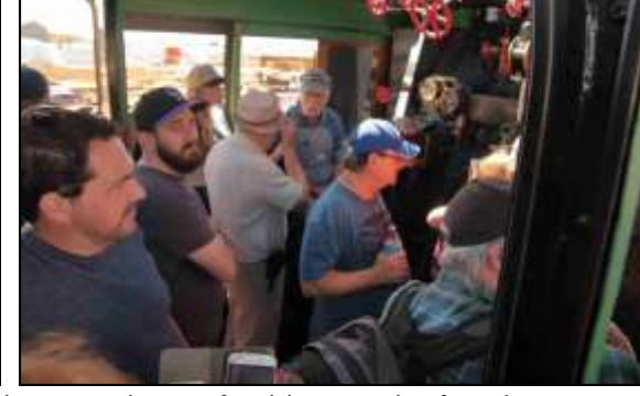
Cab Tour: An early, and very popular stop for visitors entering from the east gate was the locomotive cab (two pictures above). In the small picture, visitors are lined up for entry to the cab. In the second picture, visitors crowd the cab for a briefing on the controls, instruments. and duties of the crew members.