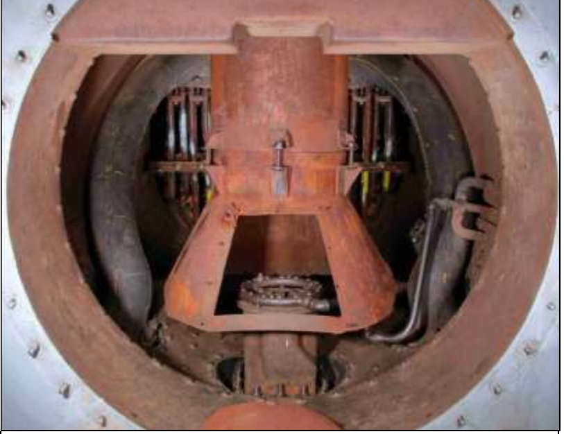
One Last Look Inside: From now on, the top of the stack will be easily seen whether extended or not, but this is a last peek inside the smokebox. Ron Taylor shot this picture before the front door was closed and bolted shut.