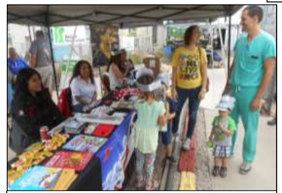
AT&SF 2926 Friends: Operation Lifesaver, Rail-Runner, Wheels Museum, Q-Lab and other organizations related to rail history and operation greeted visitors at the east gate from 8th St.