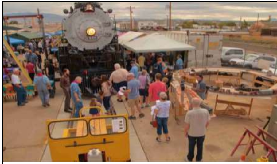
West Entrance: This photo by Ron Taylor shows the 2926 site as viewed visitors entering from the GSA parking lot. In the foreground is the Society's fully restored rail maintenance crew 'speeder'. On the right is one of the model layouts.

The pictures on this page show a glimpse of the annual event. Many more pictures with greater detail can be found on the NMSLRHS web site and Facebook Page.