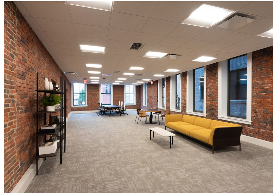
BUILDING FEATURES FRENCH OAK WOOD FLOORING AND BRICK & BEAM STRUCTURES. SECOND FLOOR SPEC SUITE OFFICE SHOWN HERE.