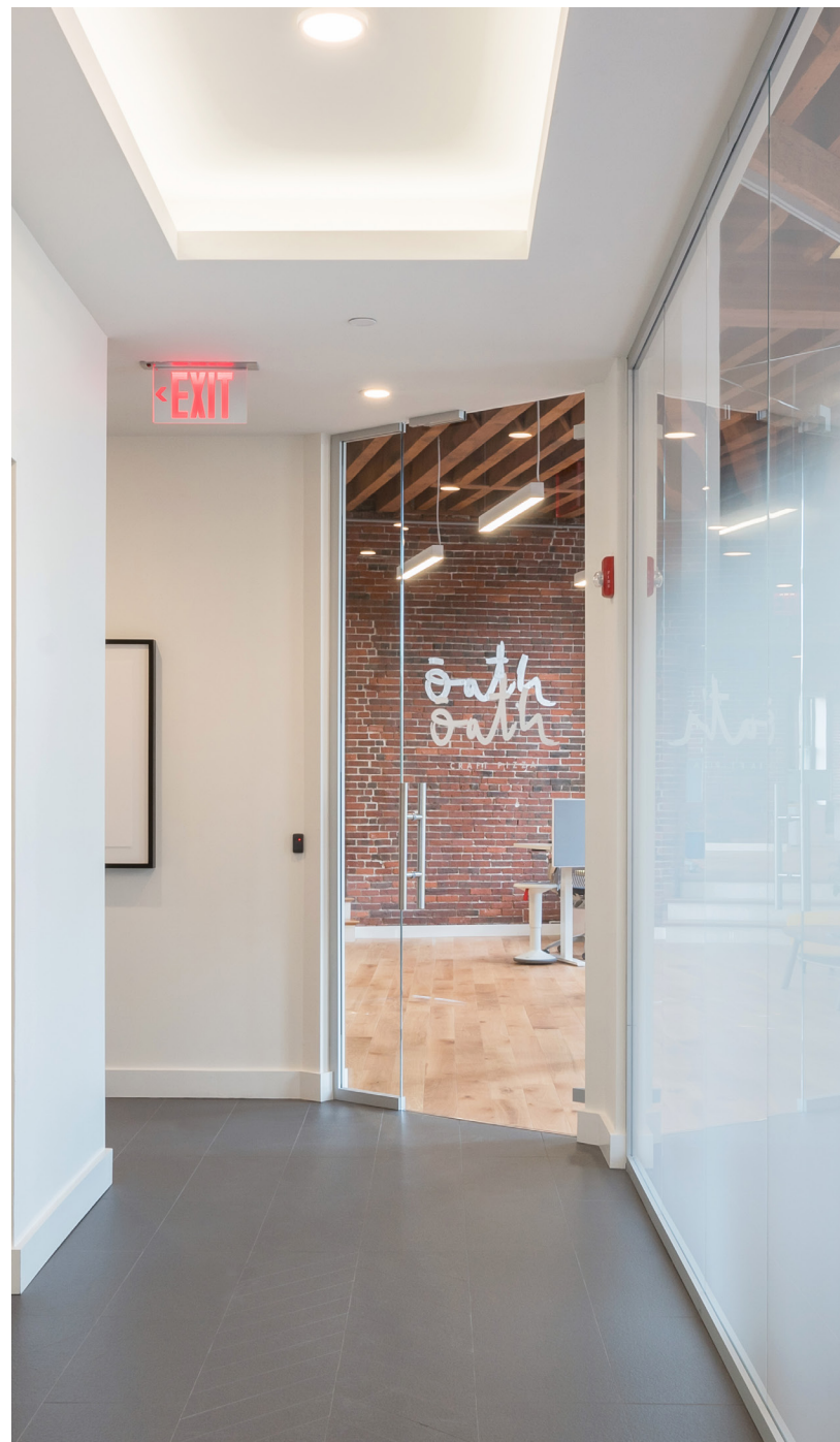
COMMON BUILDING FEATURES INCLUDE SLATE FLOORING, TRAY CEILINGS, RENOVATED ELEVATOR CABS AND COMMON RESTROOMS.