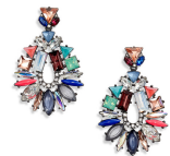
Stella and Dot