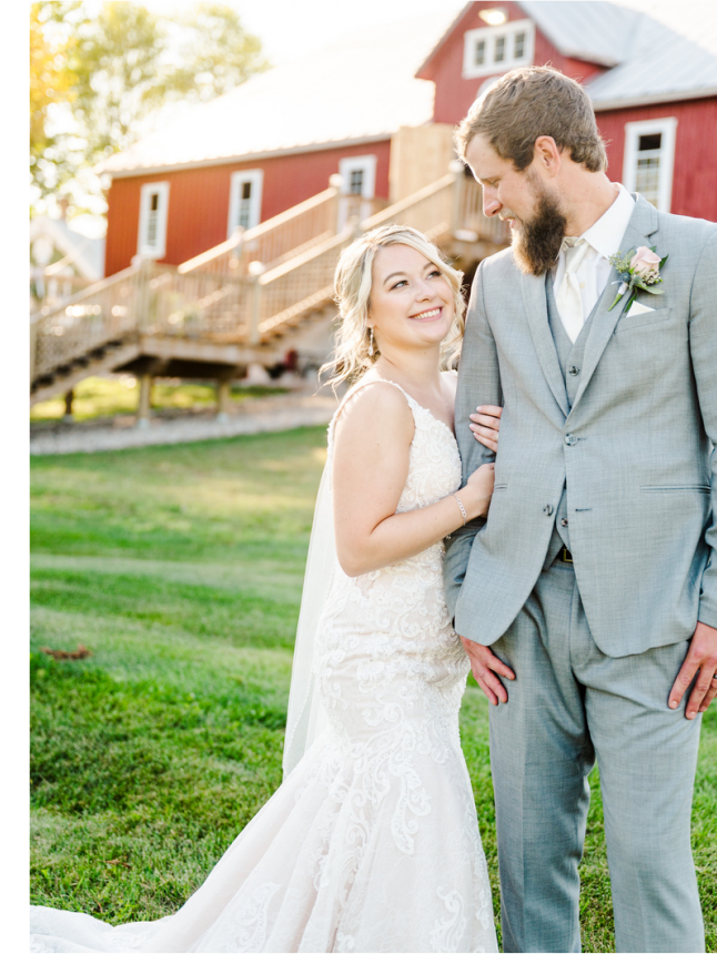
It's Your Wedding Day

Planning your wedding day should be fun! Remember to delegate jobs for the day so you can enjoy it stress-free! I will help you construct a photography timeline that not only gets you epic portraits, but allows you to enjoy your DAY 1 as Mr & Mrs.