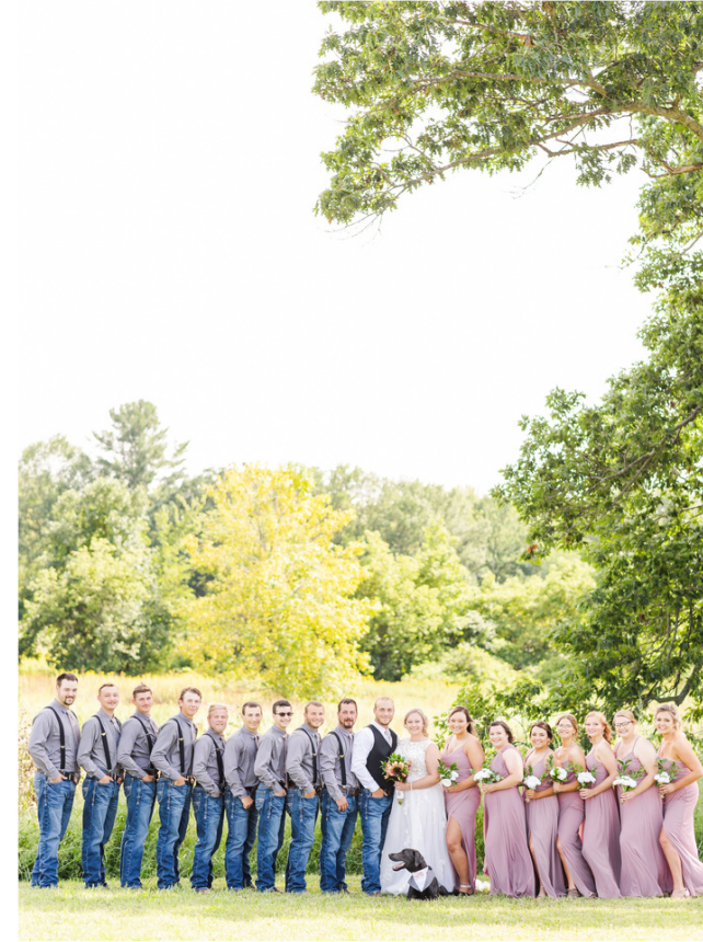
Let The Planning Begin

I include an engagement session with my Traditional Wedding Day Collection because I truly believe it is the best way for us to get to know each other. So let's start planning it. We'll pick a date that's preferably at least 4 months before the wedding (more if you need Save the Date cards, and I'll send you an engagement questionnaire. We'll get a great plan in place.