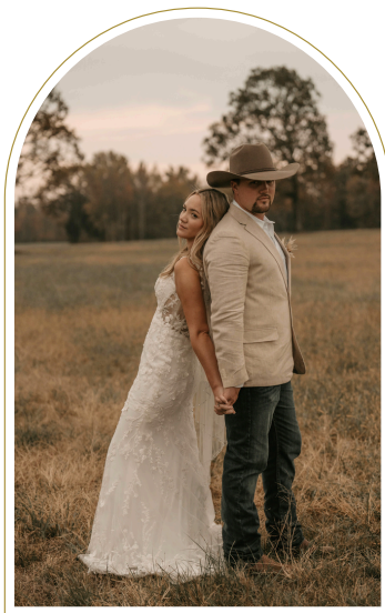
PINE CREST COLLECTION

1 photographer 8 hours coverage 1 hour engagement session digital gallery print release hand edited images