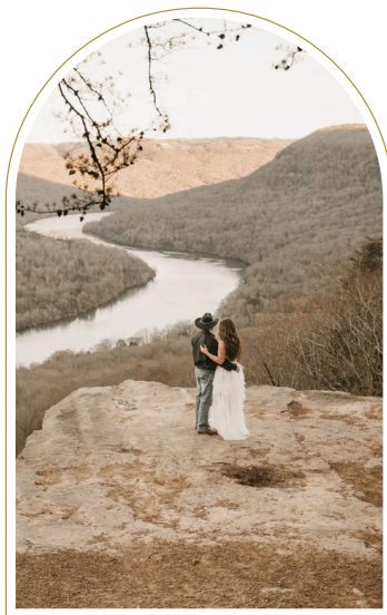
BLU PINE COLLECTION