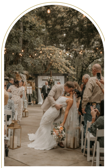
PINE LAKE COLLECTION

2 photographers 10 hours coverage 1 hour engagement session 2-3 minute highlight video digital gallery print release hand edited images