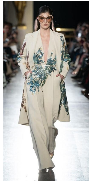
Elie Saab Couture