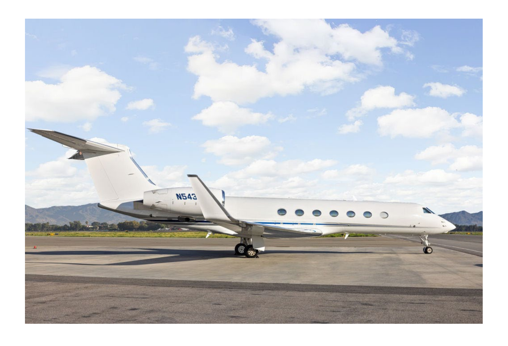
Specifications subject to verification upon inspection. Aircraft subject to prior sale without notice.